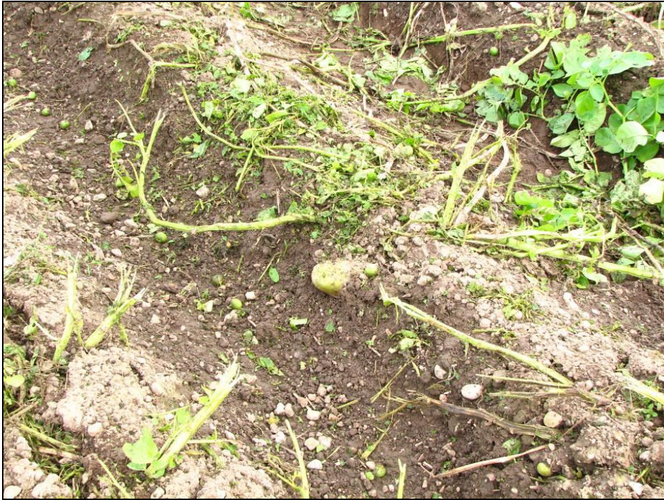
FIGURE 2. CONDITION OF HAULM AFTER PULVERISATION