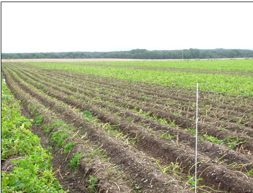
FIGURE 3. PULVERISED PLOTS AT INCHBARE