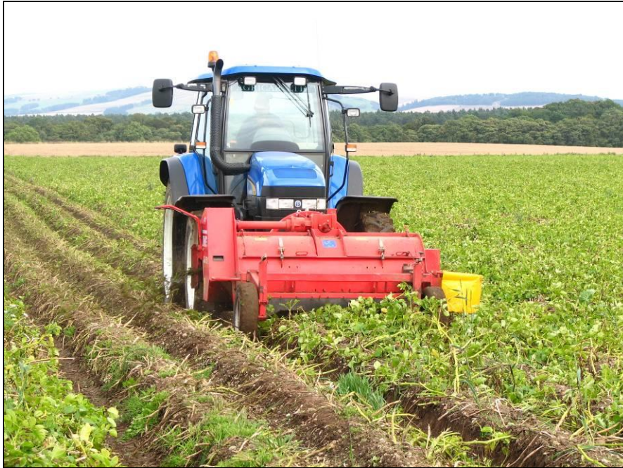
FIGURE 1. HAULM PULVERISATION AT INCHBARE

Tuber peel tests were only carried out on the tubers harvested from the Inchbare site. Five tubers from the 3 replicate digs were pooled to give one peel test for each treatment. One peel strip was removed from each tuber to include both the heel and rose ends of the tuber and the peels were fed through a Pollähne press and the resulting sap collected. As described above, the sap was serially diluted and plated on CVP agar. The plates were incubated at 28°C for 48 h, after which time the resulting colonies were verified by PCR using the De Boer primers. Results were expressed as average number of P. atrosepticum cells per ml of sap.