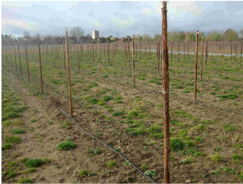
Figure 1. Plot SP250, planted in August 2014. Trees have subsequently been cut back (February 2015) to a height of 90 cm above ground level and branches below this point removed