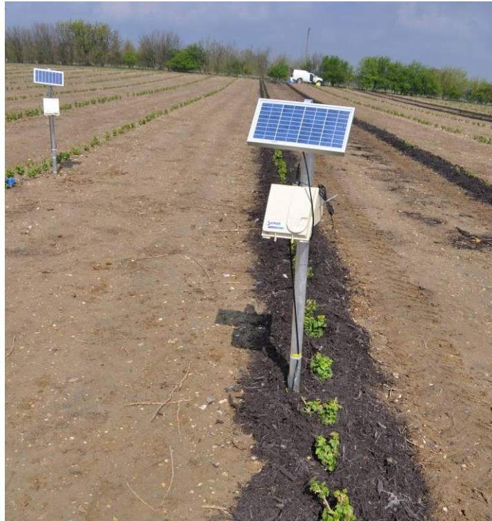
Figure 1. PAS 100 green waste mulched rows with Enviroskans™ – 13 April 2012 Coggeshall Hall Farm, Essex

There were no differences in the growth or nutrient status of the blackcurrants in the 2012 trial (Table 1), which can largely be attributed to high level of precipitation during the experiment. In effect there was no sustained period of water stress conditions during the establishment phase for this blackcurrant crop. The moisture retaining properties of the mulch treatments were therefore not properly tested within this single year experiment. The mulch also made no detectable difference to weed control. It is possible that the mulch was too shallow to provide a barrier to germination of the seed bank beneath. The application rates however were limited by the nitrate vulnerable zone (NVZ) regulations on how much green waste can be applied in a season. A thicker layer may confer some weed suppression, but the green compost did not stop wind blown seeds germinating on its surface.