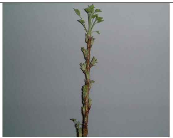
Fig 11: 8972-1, 27/3/03, 3 weeks after cutting, fully open