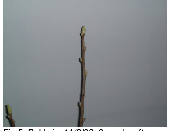
Fig 5: Baldwin, 11/2/03, 3 weeks after cutting, tip buds only breaking, not sufficient winter chill