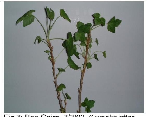
Fig 7: Ben Gairn, 7/3/03, 6 weeks after cutting, all buds burst