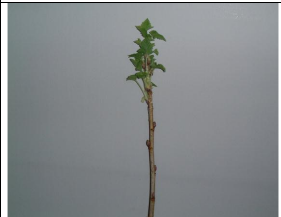
Fig 10: 8962-1, 27/3/03, 3 weeks after cutting, still not breaking