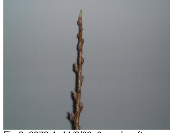
Fig 6: 8972-1, 11/2/03, 3 weeks after cutting, more than 75% bud break