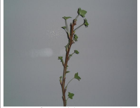
Fig 1: Ben Gairn 11/2/03, 3 weeks after cutting, one of the earliest cultivars to achieve sufficient winter chill