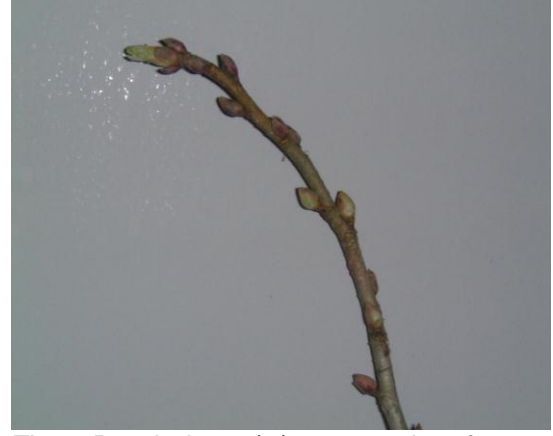
Fig 4: Ben Lair, 11/2/03, 3 weeks after cutting, tip buds only breaking, not sufficient winter chill