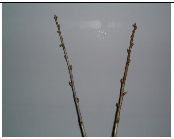
Fig 8: Ben Alder 7/3/03, 6 weeks after cutting, buds still tight