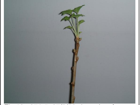
Fig 12: 871-5, 27/3/03, 3 weeks after cutting, tip buds open only