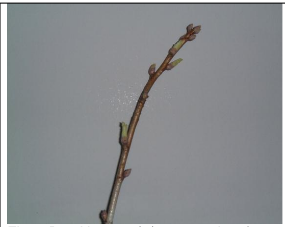
Fig 2: Ben Hope 11/2/03, 3 weeks after cutting, almost had sufficient chill, top buds breaking