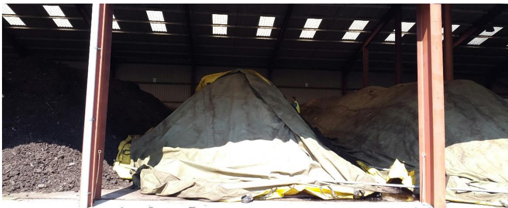
Figure 3. Three rows encompassing the composting of tomato waste at a commercial site. Compost is mixed and put in rows (right), the row is then turned (middle), before finally being left out to dry (left)

was chipped and left in a stack. At the point of crop removal and chipping in November 2015, all pieces of the waste tested for PepMV returned a positive result, and also resulted in successful infection following sap inoculation of test plants. Tomato waste remained in this stack until 2016, when the formal composting process began. Material in the stack was tested in mid-December 2015, and though PepMV was confirmed by LAMP assay in all the pieces sampled, infection was not achieved following sap inoculation at Fera. Whilst sitting in the stack, the number of sampled compost pieces where PepMV was detected by LAMP assay fell. The formal composting process began in mid-March 2016 (Figure 3), and at this point fresh green leaf from the 2016 crop was incorporated. It is likely that this introduced additional PepMV to the stack, as the number of positive samples increased at this point. Over the course of the composting process, PepMV was detected in a decreasing number of samples as the compost stack was sampled at 10 different points (at 15 and 30 cm deep, five at each depth) weekly. All sap inoculation tests failed to result in infection after the first test using freshly chipped material.