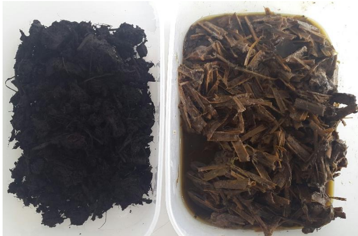
Figure 4. Compost taken from the compost row after construction at T4 (left) in comparison to the control treatment, where freshly chipped tomato waste was held at a steady 24°C for 4 months (right)

Results of PepMV testing, on compost sampled at intervals by LAMP, sap inoculation and subsequent ELISA are summarised in Tables 27 and 28 below. The compost stack evidently achieved more favourable conditions for activity of composting microbes and for breakdown of PepMV than the constant temperature control with PepMV consistently detected in more control samples than in the compost.