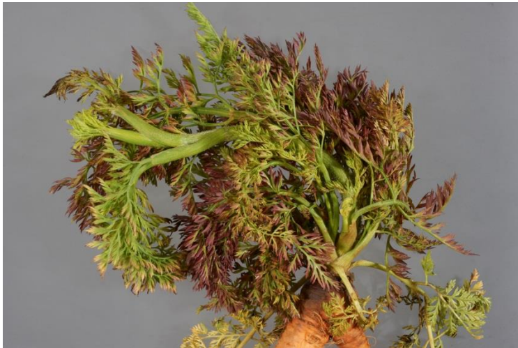
Figure C. Leaf reddening and dwarfing caused by infection with CMD disease complex

CtRLV is associated with leaf reddening (see Figure C) and CMoV with mottling which is a dappled yellowing of the leaf. However, in experimental studies, single infections by either of these viruses resulted in mild symptoms. The two viruses in co-infection have a greater effect on the plant and the result is called carrot motley dwarf disease. The third virus in the complex, CtRLVaRNA, is not known to have any noticeable effect on disease symptoms.