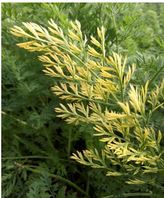
Figure E. Yellowing of foliage caused by viral infection in carrot. As this carrot contained multiple viruses the symptom cannot be definitively linked to infection with CYLV.

The virus is known to be transmitted by a similar mechanism to PYFV, where the virus is sucked into the foregut of the aphid and can be rapidly transmitted into a new host. Unlike PYFV, Carrot yellow leaf virus does not require a helper virus and onward transmission in carrot crops will occur. Foliar symptoms are thought to be an upright growth habit and yellowing of foliage (see Figure E). The virus was previously known to be transmitted by C. aegopodii , the willow-carrot aphid, C. pastinaceae , the parsnip aphid, and C. theobaldi , the willow-parsnip aphid. Transmission work carried out during this study has also demonstrated the ability of Myzus persicae , the peach-potato aphid, to transmit the virus. This study has shown the virus to be present in a wide range of apiaceous weed hosts as well as carrot crops, however, the relative importance of each virus source is not yet known.