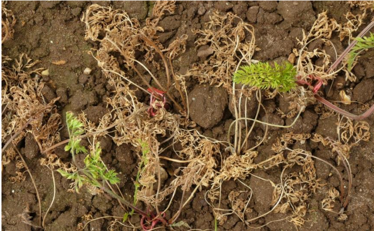
Figure B. Seedling death in carrots caused Parsnip yellow fleck virus

AHDB-Horticulture project FV 228a demonstrated that the source of PYFV infections in carrots are most likely to be associated with cow parsley ( Anthriscus sylvestris ), a common hedgerow weed. As carrots are not a host of AYV, once they are infected with Parsnip yellow fleck virus the virus cannot be passed on.