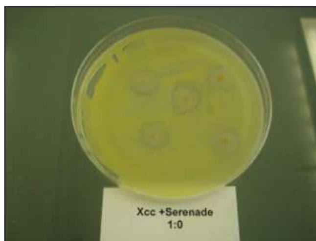
Figure 2 : Example of zones of inhibition in 'Serenade' challenge inoculation plates.

The zones of inhibition were seen most clearly at the higher concentrations of 'Serenade' (1:0 – 1:100), with less marked zones observed in the two lower concentrations.