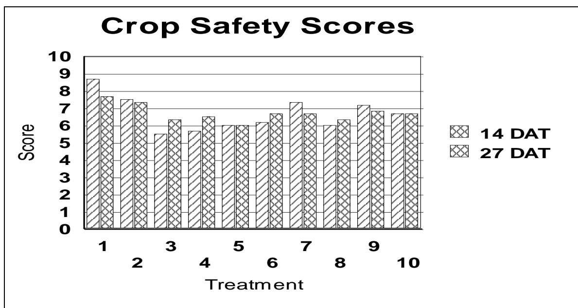
Figure 2. Crop Safety Scores

Crop safety score on a 0-9 scale assessed crop reaction to treatments as expressed by growth and development, particularly leaf number and size, and visible leaf condition. 0 = crop killed, 9 = no crop damage.