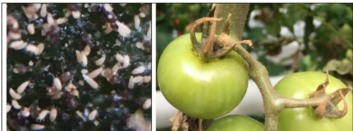
Figure 3. Left: Individual Aculops lycopersici on tomato leaves. Right: populations of A. lycopersici on fruit and calyx causing visible symptoms of golden/brown colouration on calyx.

Eriophyid mites are known to disperse by crawling, wind, and by hitching a ride on other organisms (Sabelis and Bruin, 1996, CABI, 2019b). Adult females are usually highly abundant on plants with visible symptoms. Although the mites are extremely small they can be seen with a x14 hand lens, but identification is easier with the use of a stereomicroscope (x30). TRM populations usually develop at the base of the plant and move upwards, feeding on green tissues. Often the highest number of mites can be found just above the visible signs of tissue damage (Kay, 1986). As the population density of TRM increases on a plant, the mites increase their feeding rate, which can ultimately lead to the death of the plant.