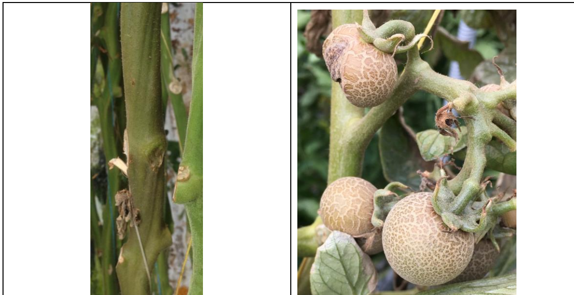
Figure 4: Left: discolouration on tomato stems and dried out leaves caused by A. lycopersici . Right: severe russetting on tomato fruit.