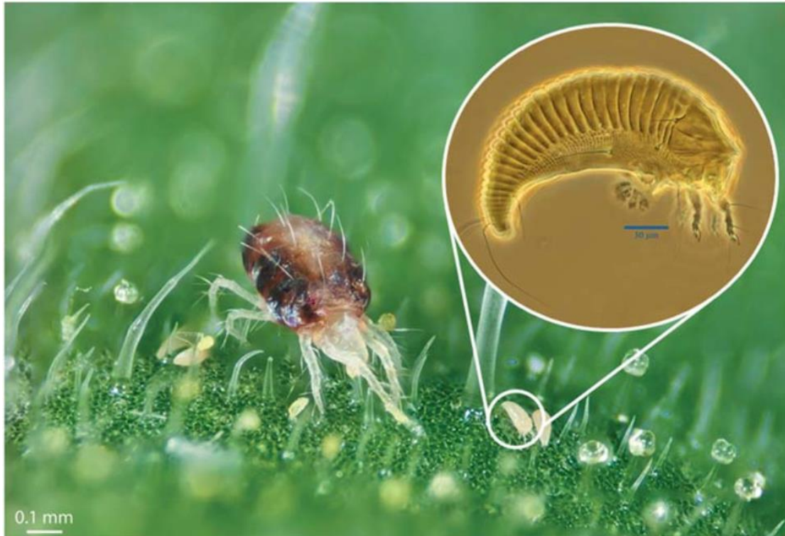
Figure 1: showing a two-spotted spider mite ( Tetranychus urticae ) (centre) surrounded by a number of tomato russet mites Aculops lycopersici which are visible as small white spindle shaped organisms. The insert (right) shows a close up image of A lycopersici with a 30 µm blue scale bar. (Glas et al., 2014).

Eggs hatch within 2 days of laying at room temperature (Bailey and Keifer, 1943). The larval stage lasts 1 day, and the nymphal stages 2 days. The TRM can double its population in three days at 25 °C (Fischer and Mourrut-Salesse, 2005). It has been observed by Rice and Strong (1962) that the complete life-cycle is 6.5 days at 21 °C and 30% RH. At very high temperatures (32 °C) TRM requires low relative humidity for survival. Optimal conditions for the TRM were found to be 26.7 °C and 30% RH (Rice and Strong, 1962). More recent studies have measured TRM development at a range of temperatures from 8 °C to 39 °C, at 55 %RH (Alazzazy and Alhewairini, 2018). Mite development at either 8 °C or 39 °C was so slow (or ceased altogether) that the adults died, but they were able to survive and reproduce between 11 °C and 36 °C. The highest rate of population increase was at 32 °C, where the population multiplied 18.14 times in a generation time of 14.45 days. At 11 °C the rate of population increase lowered to 4.25 times in a generation time of 26.38 days. Alazzazy and Alhewairini's studies were all conducted under laboratory conditions.