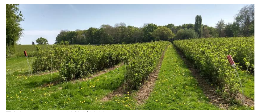
Trial at set up - 23/04/2020