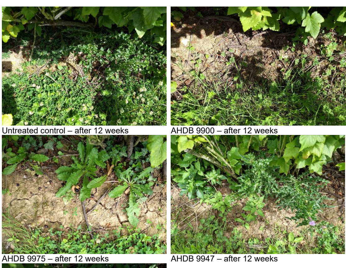
AHDB 9917 - after 12 weeks