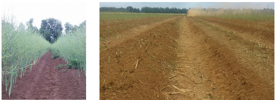
Figure 1 left. Post-harvest trial site on 11 June before first flail down carried out on 21 June Figure 1 right. Post-harvest trial site on 9 July when post-em herbicides were applied after final flail to remove spears

The post-harvest trial was flailed twice (21 June and 1 July) before herbicide application due to a late change of site agreed with the Asparagus Growers Association, after the initial site became unavailable. The fern had already expanded as shown in Figure 1, but as it was still young and not tough, and also had good vigour it was determined flailing down again would be acceptable and not affect the trial. No post-harvest herbicides had been applied, the site remained clear of weeds due to dry conditions. It was agreed to flail the crop once more -9 July - immediately before the application of the herbicides as the spears had grown rapidly. Once mown pre application the trial site appeared as in Figure 1 on the right.