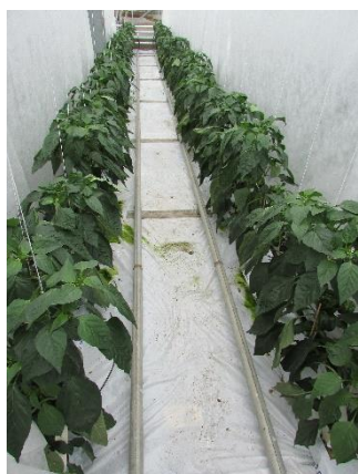
Fig.1. Row of trial peppers in situ.