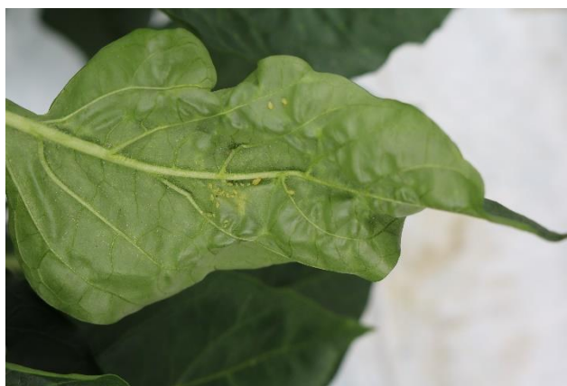
Fig.2. Aulacorthum solani on an untreated plant at the end of the trial, showing aphid-induced foliar damage.