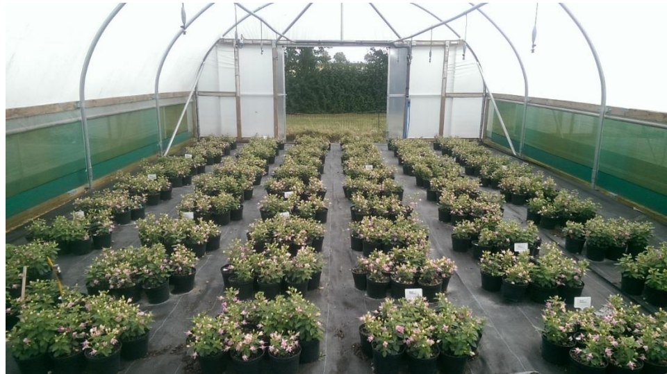
Figure 1 Trial on Fuchsia erecta which took place in a polytunnel at ADAS, Boxworth.

All treatments were applied once. Treatments 2 and 8 are substrate-incorporated and were applied preventatively in the plugs for the F. erecta cuttings and at potting on.