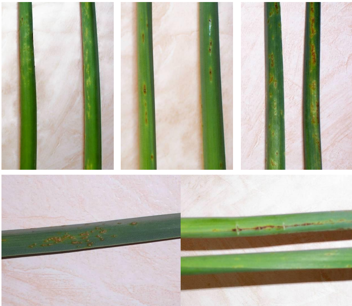
Different severity of rust symptoms. Top: increasing rust severity with blistering (left), a few rust lesions (middle) and larger, coalescing lesions (right). Bottom: close-up of blistering (left) and rust lesions with cracking (right).

The progress of daffodil rust development on stems over the three assessment dates is shown in the figure below. Tregiffian had both the earliest appearance of daffodil rust and its highest final incidence, and incidence was also high at St Buryan, Rosevidney and Penventon. Levels were lower at Roseworthy and Mawla, while the plots at Kelynack, Bodilly, Fourburrow and Goonhavern remained virtually free of the disorder.