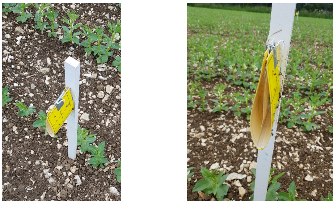
Figure 2. Example of bean seed fly adult monitoring trap containing sticky card and plant volatile lure.