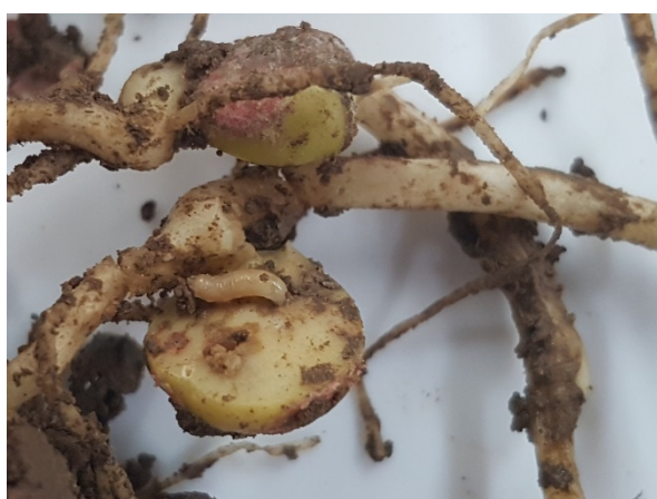
Figure 3. Bean seed fly damage to pea seed (seed tunnelling)

Establishment of seedlings was slow and variable at Stubton in 2020 due to dry weather following sowing (Table 5, Appendix A) and growth stage at the first assessment on 26 th May