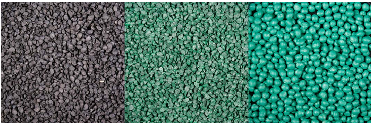
Figure 2. Untreated, film-coated and pelleted onion seed