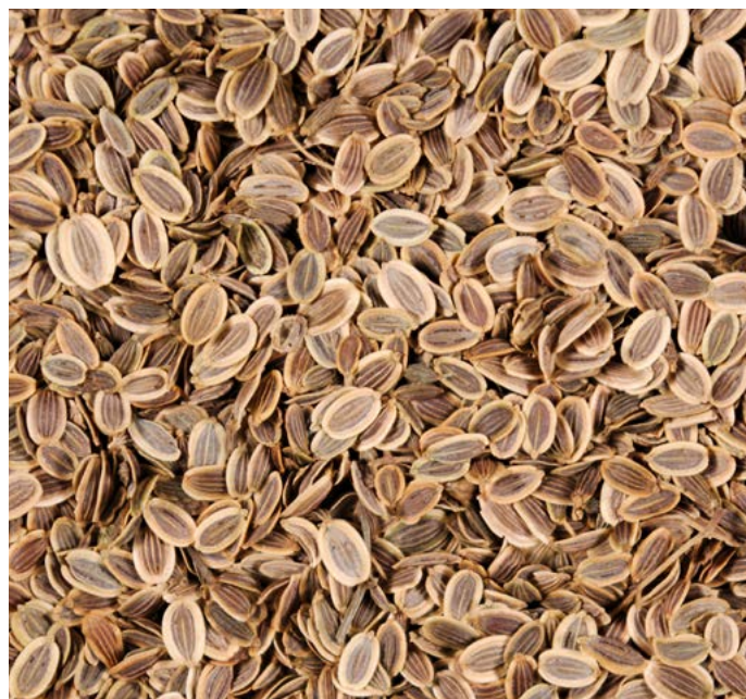
Figure 7. Untreated Dill seed