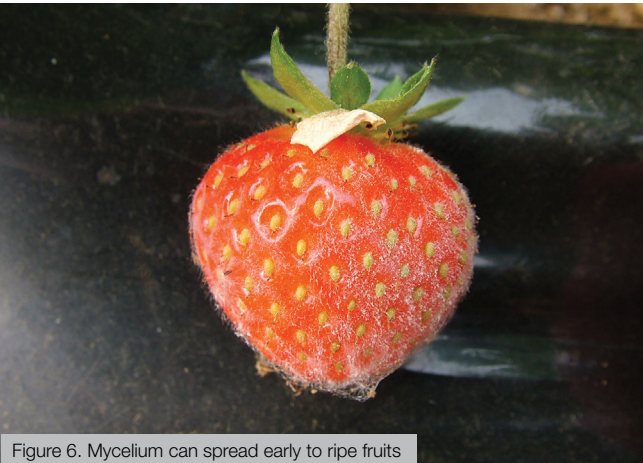
Figure 6. Mycelium can spread early to ripe fruits