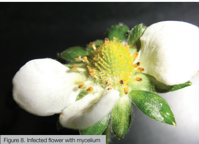
Figure 8. Infected flower with mycelium