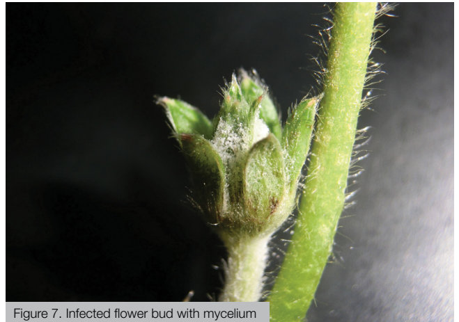
Figure 7. Infected flower bud with mycelium