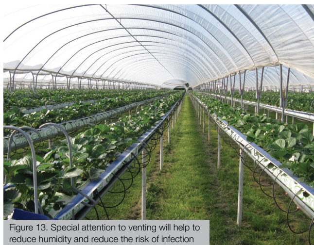
Figure 13. Special attention to venting will help to reduce humidity and reduce the risk of infection

The risk warning system has been designed to help growers achieve good control of powdery mildew with reduced fungicide applications. Growers should pay particular attention to spray coverage as results show that there is more, early mycelium on the underside of the leaves.