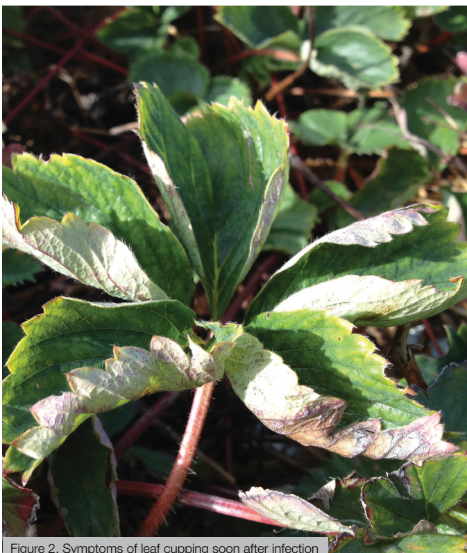
Figure 2. Symptoms of leaf cupping soon after infection

Strawberry powdery mildew exhibits a range of symptoms. Healthy strawberry plants have flat leaves, but they begin to cup soon after infection (Figure 2) and then red blotches (Figure 3) begin to form (depending on variety). Mycelium starts to spread and the production of asexual conidiospores creates the characteristic powdery effect, which may then become visible on the leaves (first on the lower then the upper surfaces – Figure 4) and petioles (Figure 5). In some varieties visible mycelium appears first on the leaves, petioles and peduncles and spreads early to the fruit (Figure 6). If effective treatments are not applied, mycelium can form on the flower buds (Figure 7), open flowers (Figure 8) and fruits (Figures 9 and 10). Leaf-cupping can occur for several reasons but in well managed tunnels where temperature and relative humidity are well controlled, leaf-cupping is highly likely to be the first visible symptom of strawberry powdery mildew. If cupping persists for 24 hours or more and is present early in the morning, it should be noted as the first warning sign of powdery mildew infection and mycelial growth.