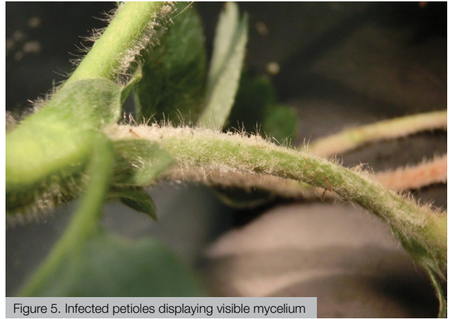
Figure 5. Infected petioles displaying visible mycelium