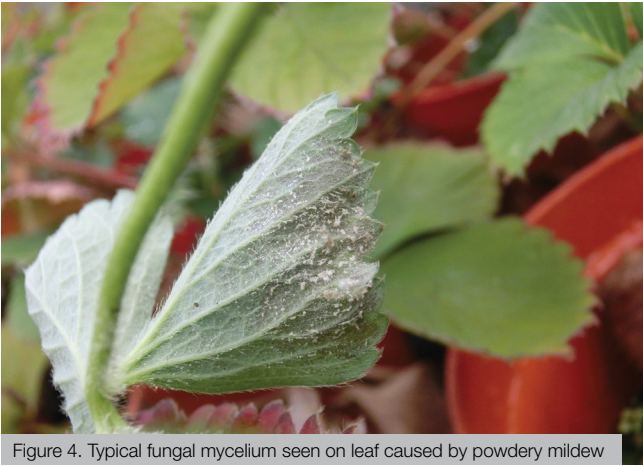
Figure 4. Typical fungal mycelium seen on leaf caused by powdery mildew