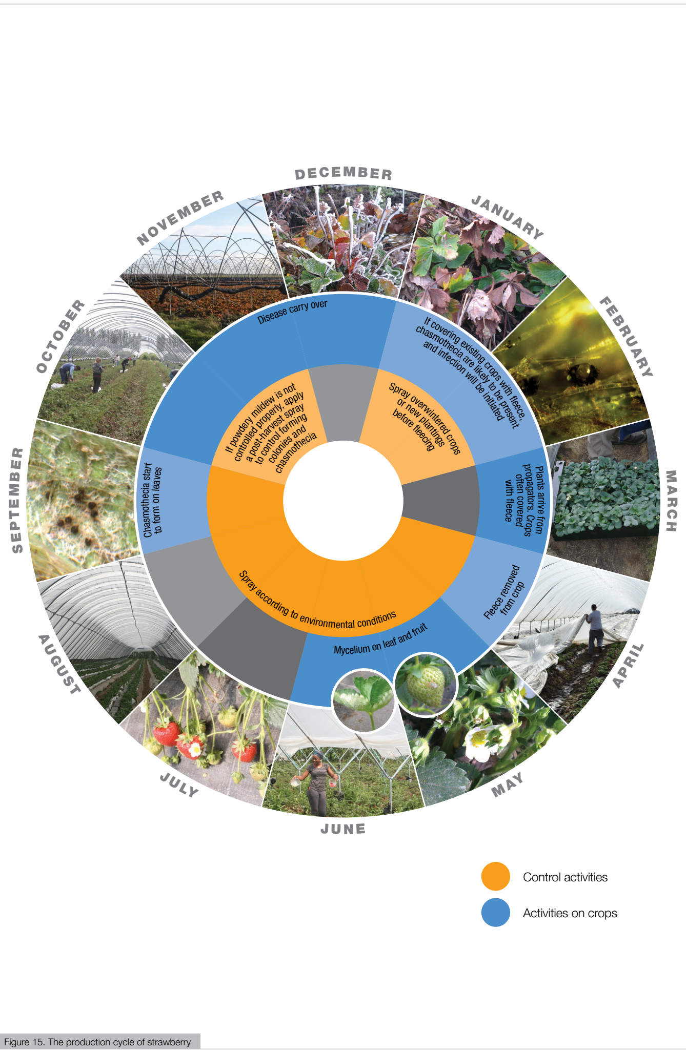
Figure 15. The production cycle of strawberry