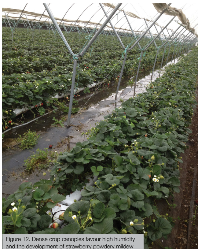
Figure 12. Dense crop canopies favour high humidity and the development of strawberry powdery mildew

The system has been tested in commercial strawberry production where it helped to reduce the number of spray applications required to gain effective control of powdery mildew. A web based platform to allow growers to use this on a practical basis is currently being developed by NIAB and growers should keep abreast of this development and seek to use it when it becomes commercially available.