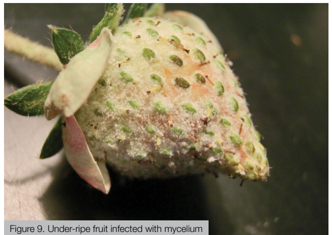
Figure 9. Under-ripe fruit infected with mycelium