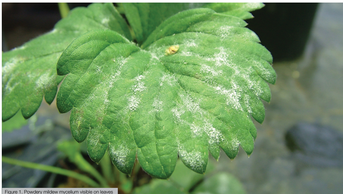
Figure 1. Powdery mildew mycelium visible on leaves

This factsheet describes the symptoms (Figure 1) and life cycle of strawberry powdery mildew and how it becomes established and spreads through crops grown under protection. It also provides guidance on management strategies to minimise the risk of damaging epidemics developing.