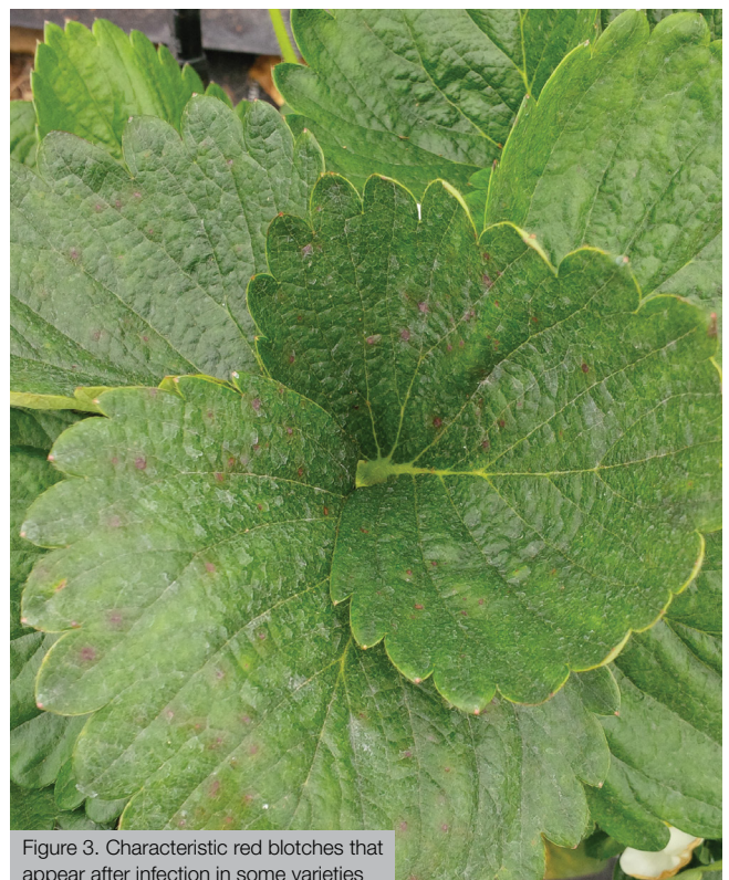
Figure 3. Characteristic red blotches that appear after infection in some varieties