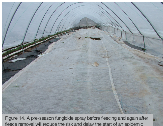
Figure 14. A pre-season fungicide spray before fleecing and again after fleece removal will reduce the risk and delay the start of an epidemic