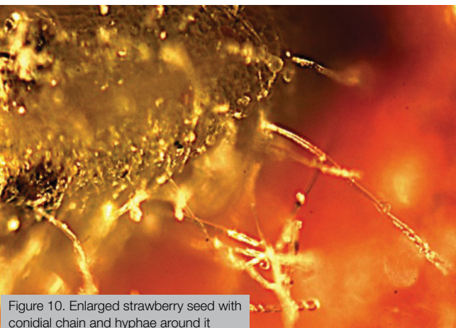
Figure 10. Enlarged strawberry seed with conidial chain and hyphae around it

Research in Project SF 62 compared cupped with flat leaves. Microscopic examination showed that both cupped and red-blotched leaves had more mycelium present than flat (apparently healthy) leaves. However, even on flat leaves, very small amounts of mycelium were sometimes present (upper or lower surface). For each associated symptom, the amount of mycelium measured increased with sample date.