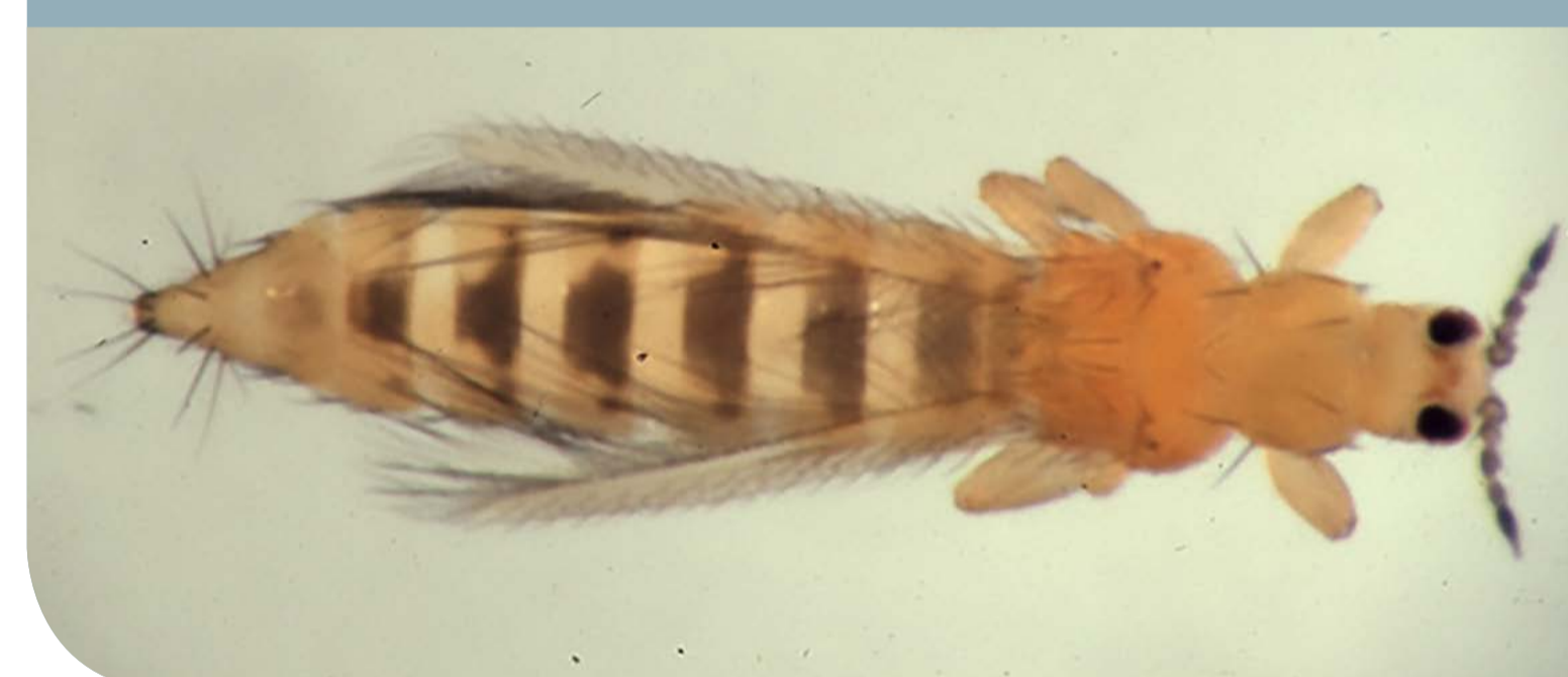
Thrips Thrips tabaci