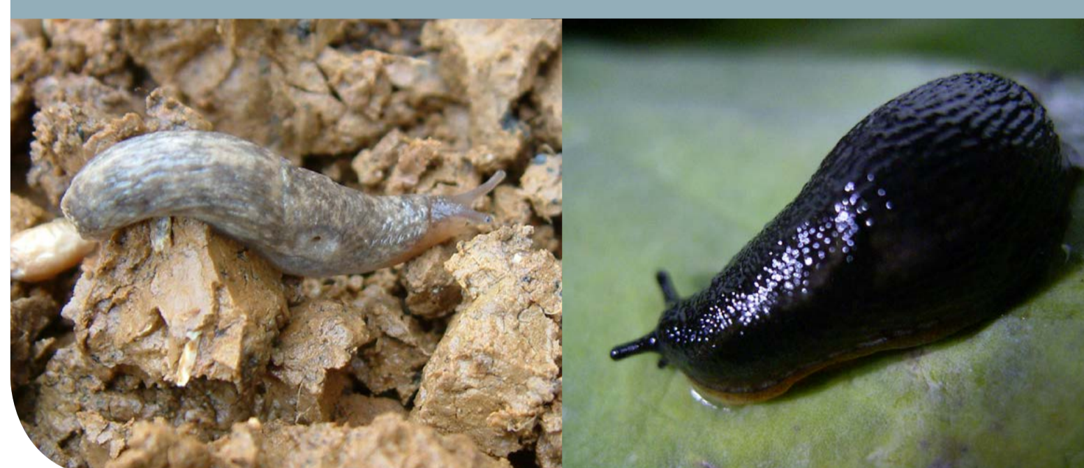
Slugs Deroceras, Arion and other spp.