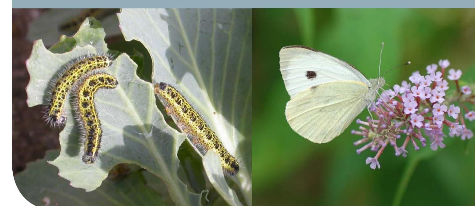
Large white butterfly Pieris brassicae