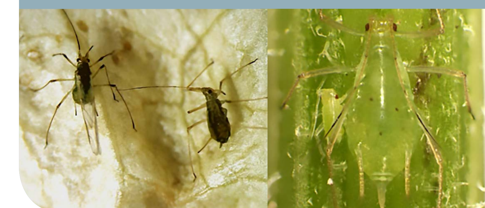
Potato aphid Macrosiphum euphorbiae