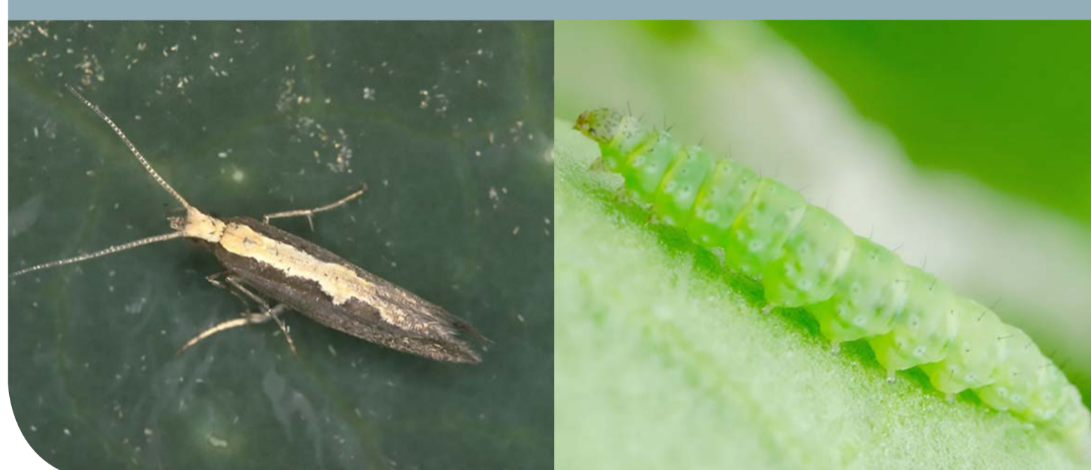
Diamondback moth Plutella xylostella