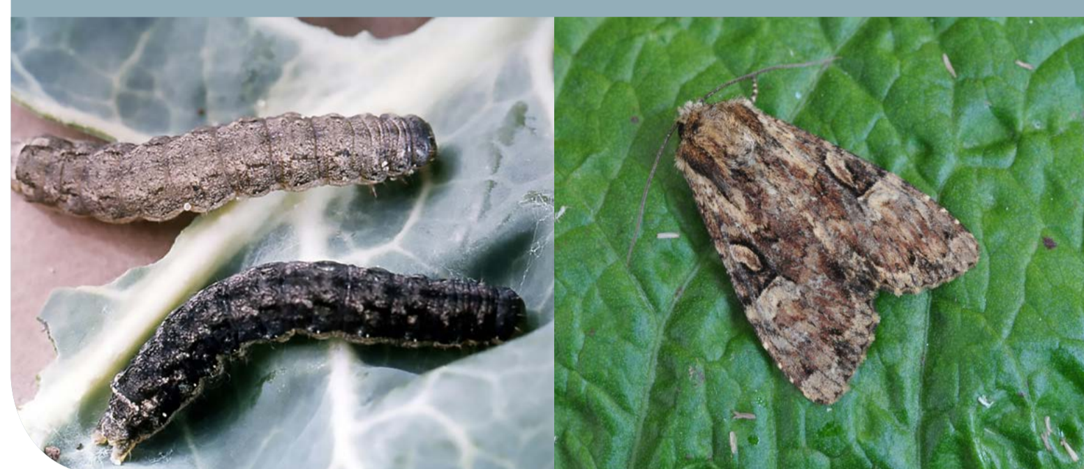
Cabbage moth Mamestra brassicae