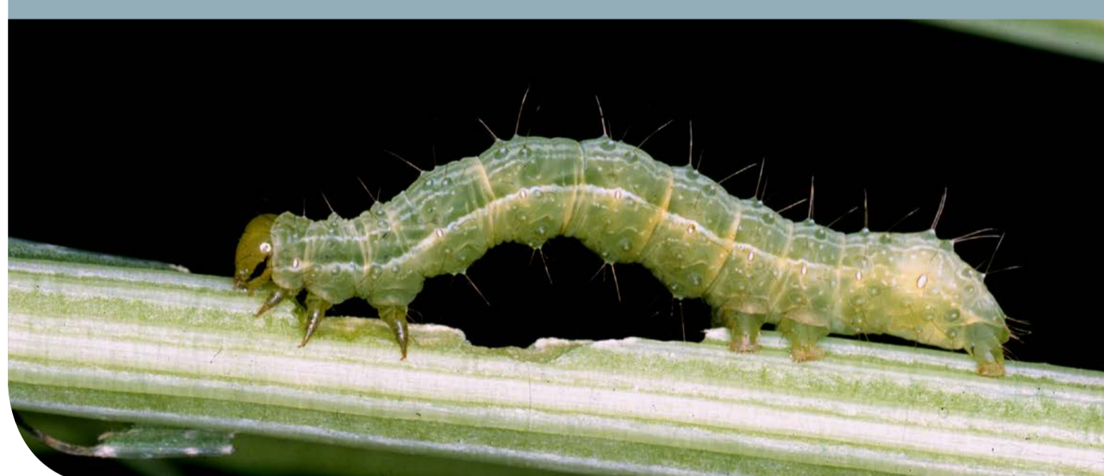
Silver Y moth Autographa gamma