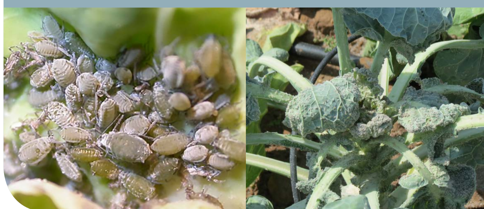
Cabbage aphid Brevicoryne brassicae