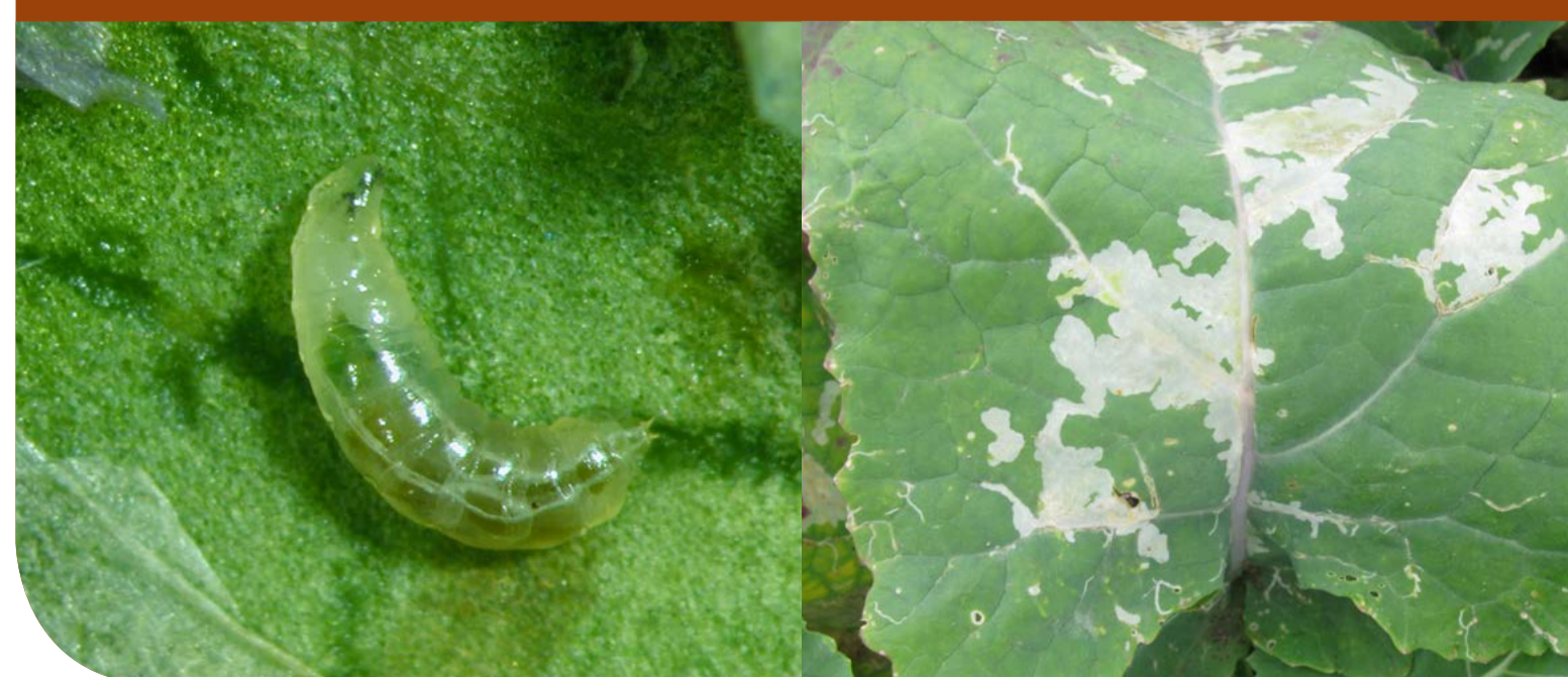
Leaf miner Scaptomyza flava