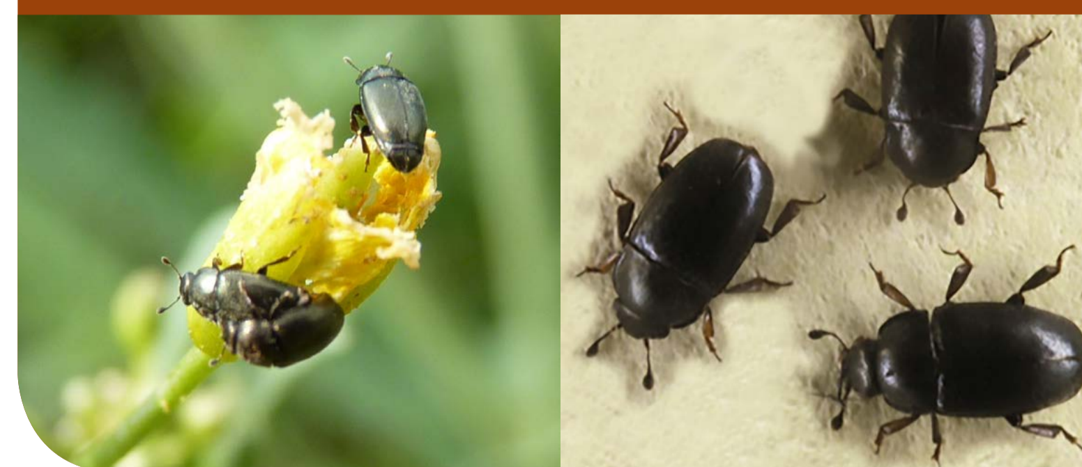
Pollen beetle Meligethes spp.