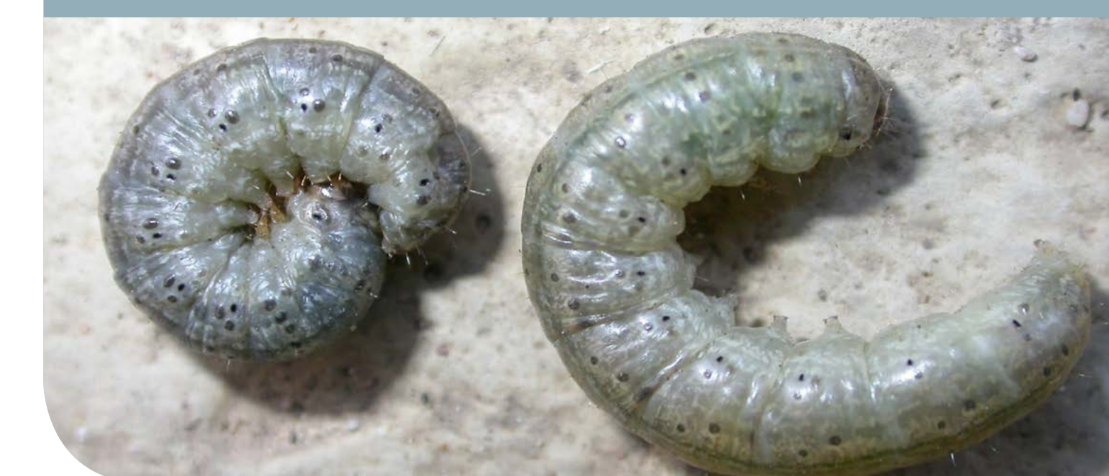
Cutworm Agrotis segetum