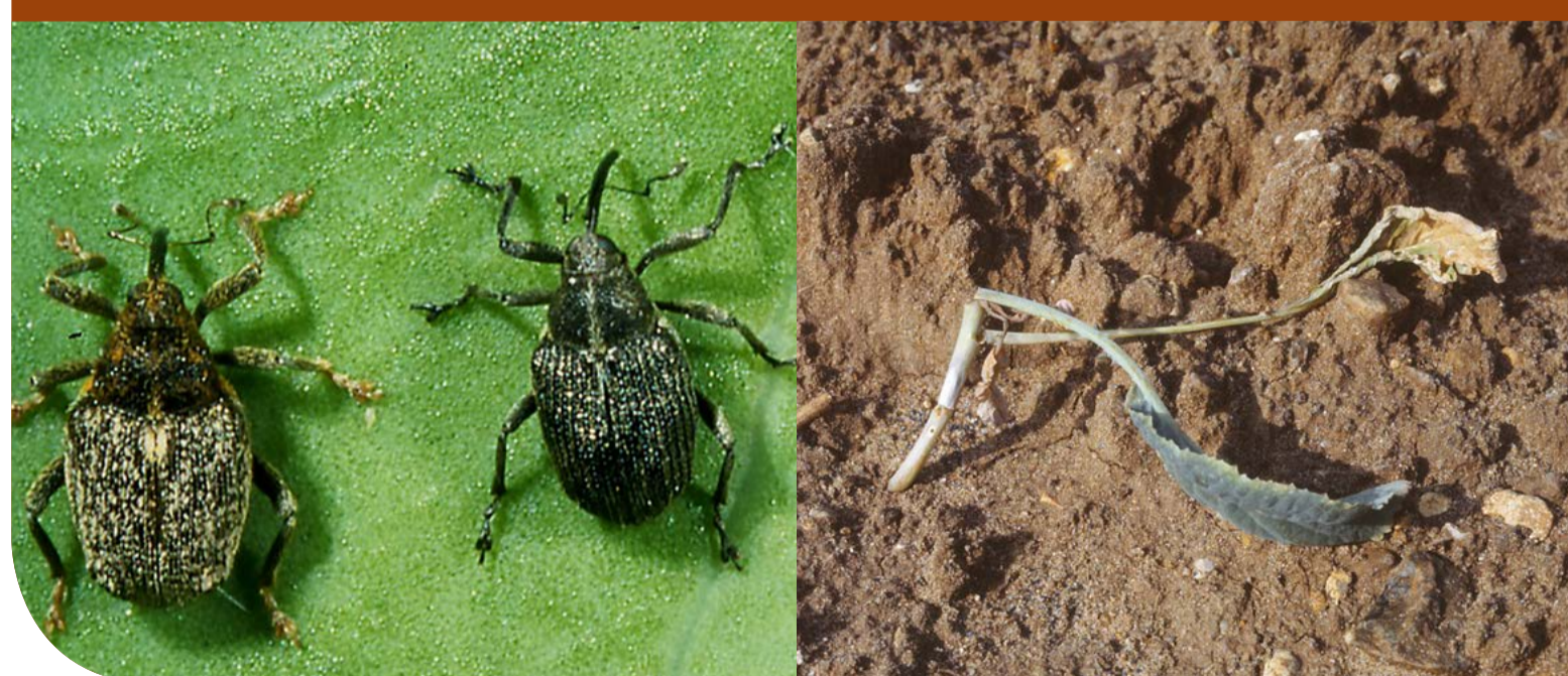
Cabbage stem weevil Ceutorhynchus spp.