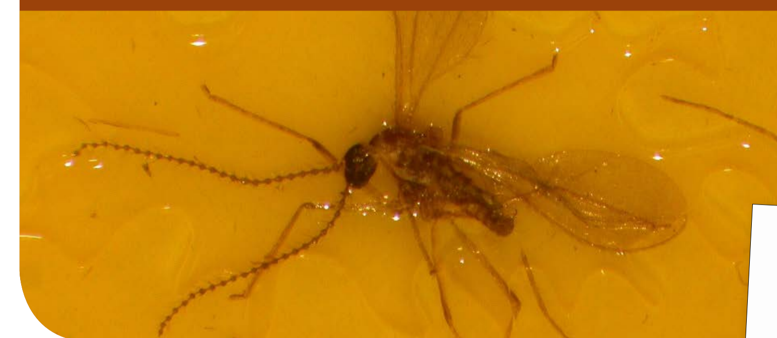
Swede midge Contarinia nasturtii