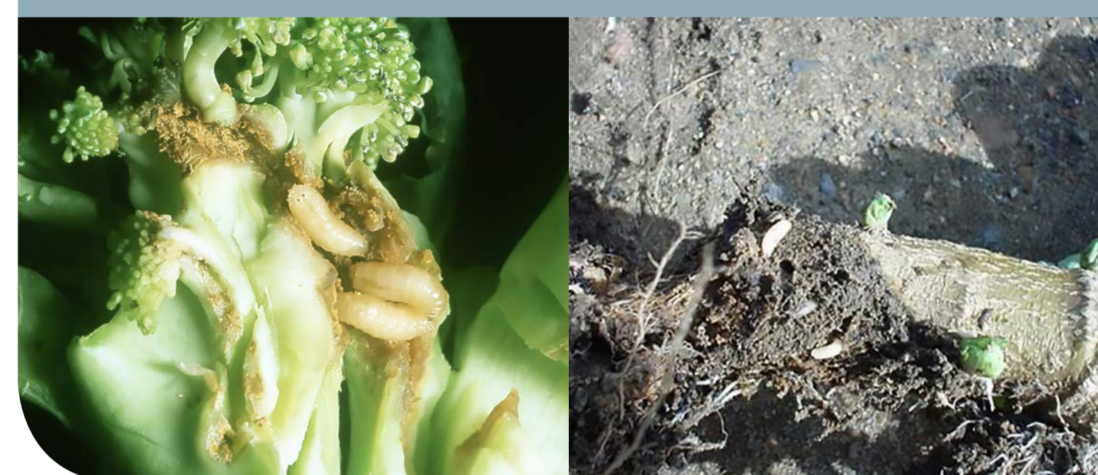
Cabbage root fly Delia radicum