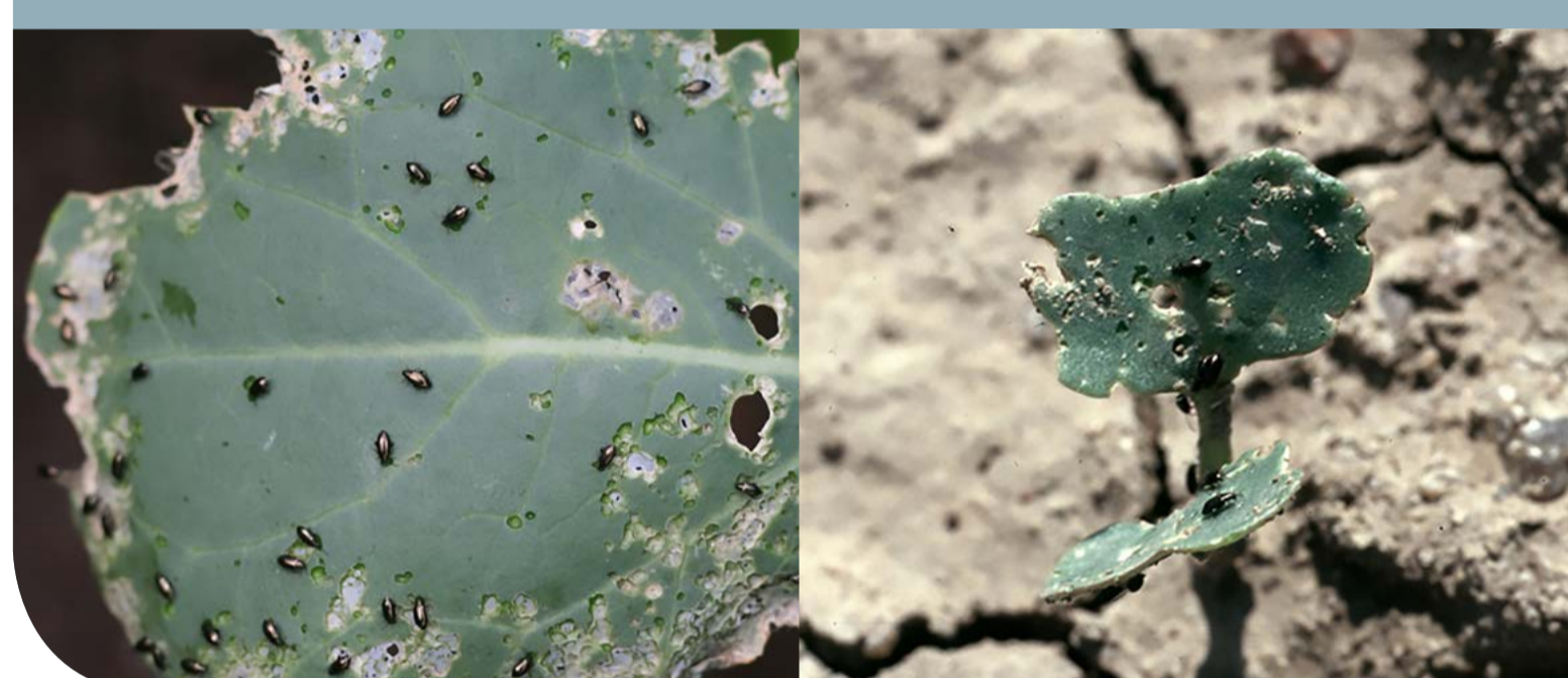
Flea beetles Phyllotreta spp.