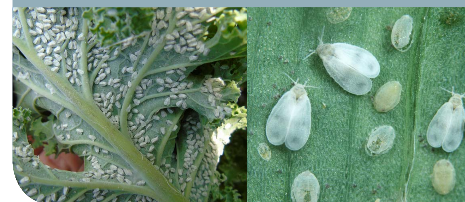
Cabbage whitefly Aleyrodes proletella