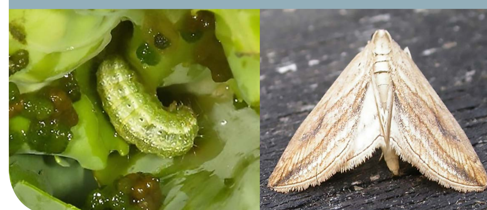
Garden Pebble moth Evergestis forficalis