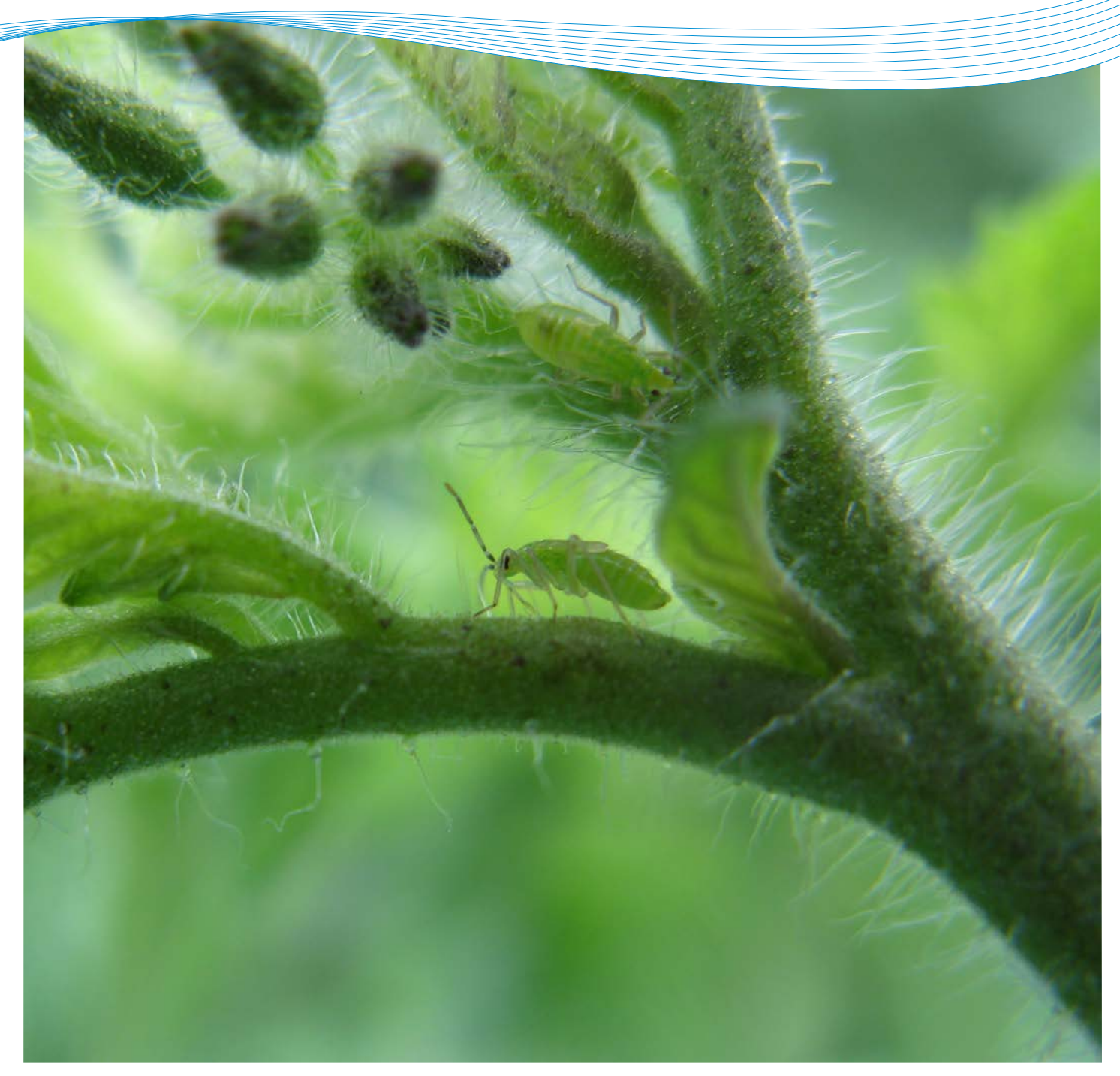
Figure 1. Nesidiocoris tenuis late stage nymphs with wing buds

The mirid bug, Nesidiocoris (Cyrtopeltis) tenuis , is not a native of the UK but there is evidence that it is moving north and has already become established in glasshouses in some northern European countries. Both adults and nymphs are predators and can make a useful contribution to integrated pest management (IPM) in tomato crops. However, in the absence of insect or mite prey, the bug will turn its attention to the tomato plants and can cause serious economic damage. This factsheet is intended to increase grower awareness of the insect and the damage that it causes, as well as helping growers to distinguish it from Macrolophus pygmaeus – a similar mirid bug which is already used in tomato IPM programmes in the UK.