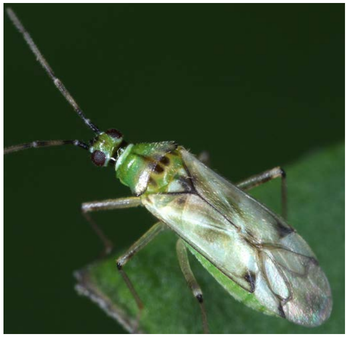
Figure 3. Nesidiocoris tenuis has a dark coloured band behind the eyes and black 'knees' – both are features which can be used to distinguish it from Macrolophus pygmaeus

If in any doubt, growers should seek the assistance of an entomologist with experience of working with both species.