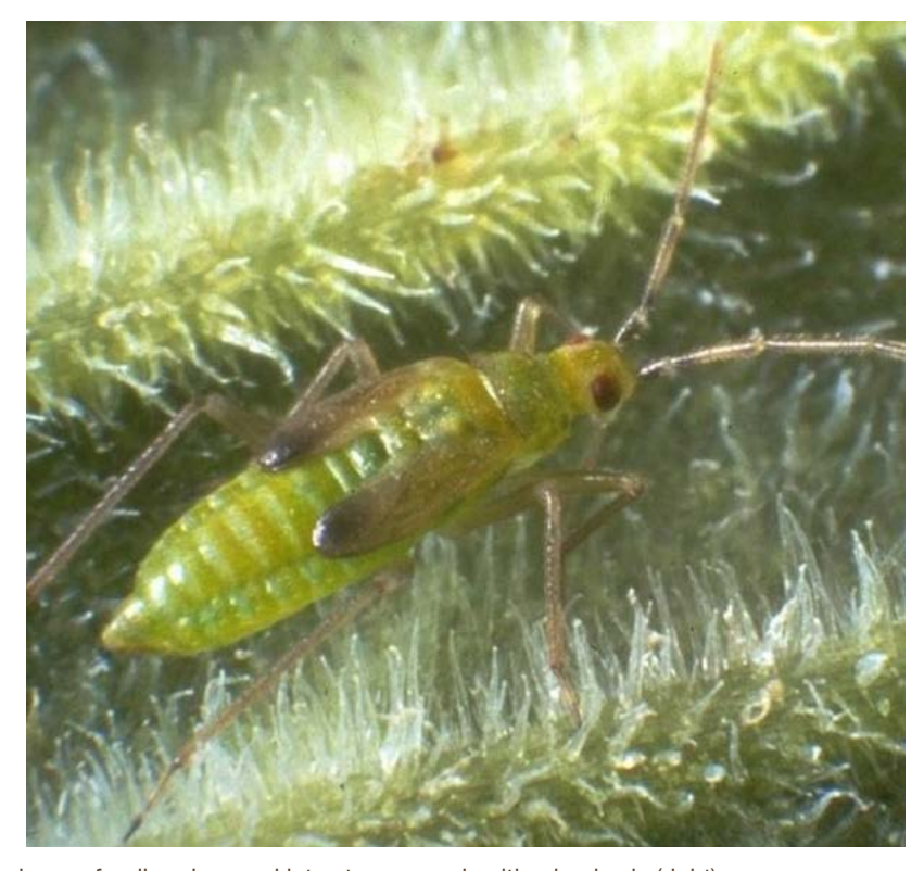
Figure 2. Nesidiocoris tenuis adult (left), with an example of a brown feeding ring, and late stage nymph with wing buds (right)