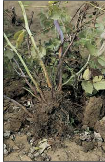
3 Raspberry canes exhibiting blue streaks extending from soil surface