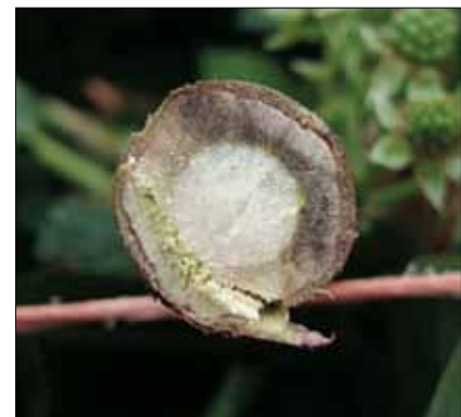
6 Infected vascular tissue in the stem base