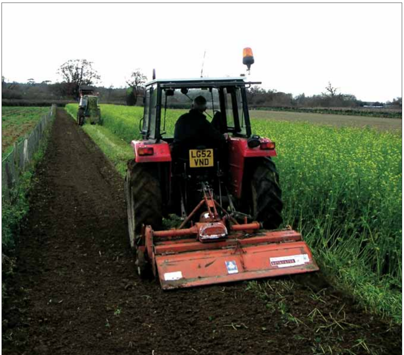
11 The use of Brassica species as a cover crop, when incorporated into the soil, is said to provide some level of reduction of existing V. dahliae and V. albo-atrum spores

Sorghum and Brassica species) which, on incorporating into the soil, break down releasing methyl isothiocyanate and/or other fungitoxic chemicals. These offer some control of V. dahliae and V. albo-atrum (Figure 11). The incorporation of cover crops also helps to improve the nutrient content of the soil, its structure and its water holding capacity. A HortLINK project (SF 77) which was part-funded by HDC, was recently undertaken to examine the effects of a range of cover crops on the suppression of Verticillium in field soils. Although residues from lavender appeared to be most successful, a commercial system for harnessing by-products of lavender is not currently available. In the short term it is not thought that any of the materials tested are likely to offer