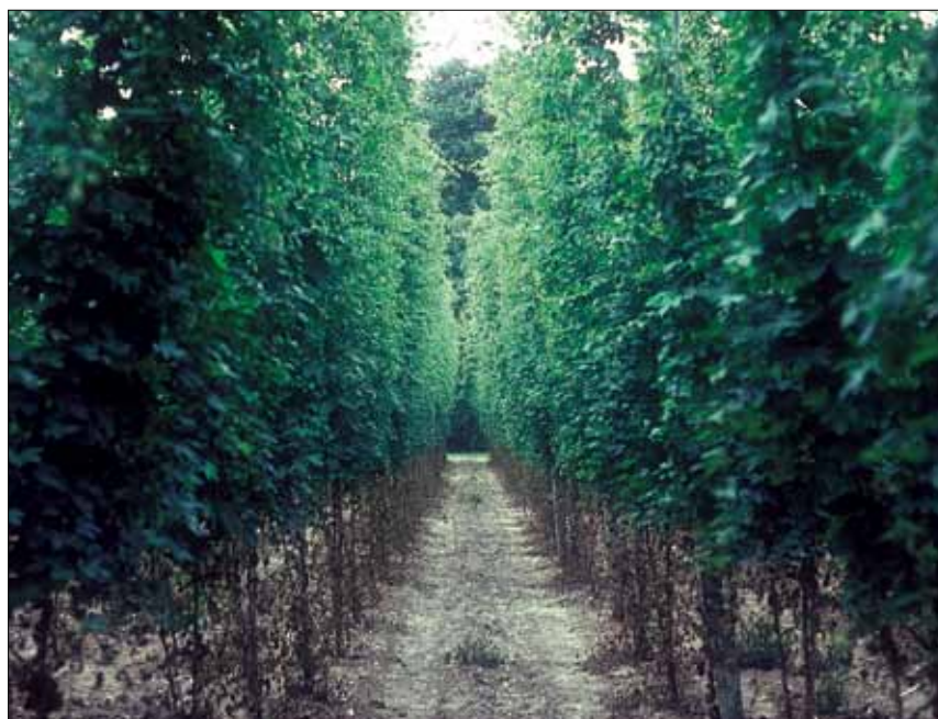
8 It is wise to undertake a soil test to detect the presence of V. dahliae following crops of hops

The test described above, which was developed in the 1980s, only assesses the presence of V. dahliae , and takes up to six weeks to conduct, due to the nature of the procedure. HDC is funding a project (SF 97) at the Food and Environment Research Agency (Fera) which is developing a new molecular test (using PCR technology) to quantify the levels of V. albo-atrum as well as V. dahliae . The test should be capable of producing an accurate result in only a few days. The new test should allow growers to make much quicker decisions on the suitability of field soils for strawberry and cane fruit production.