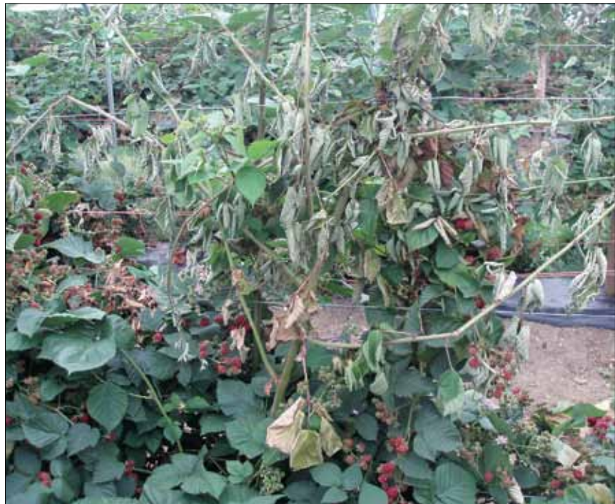
4 Blackberry cane exhibiting symptoms of wilting