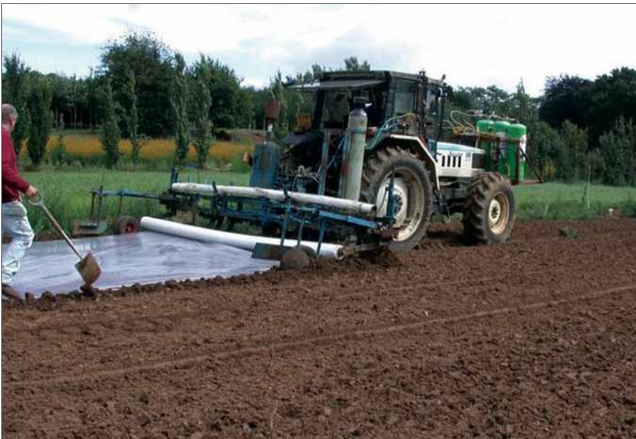
12 In the short term, it is likely that growers will need to continue to rely upon chemical control options to gain an acceptable level of control

Whichever option a grower or consultant chooses to treat the soil, it is very unusual for complete control of the pathogen to be gained. For best results, soil preparation prior to treatment, conditions at the time of application and the distribution of the chemical during application must be absolutely perfect across