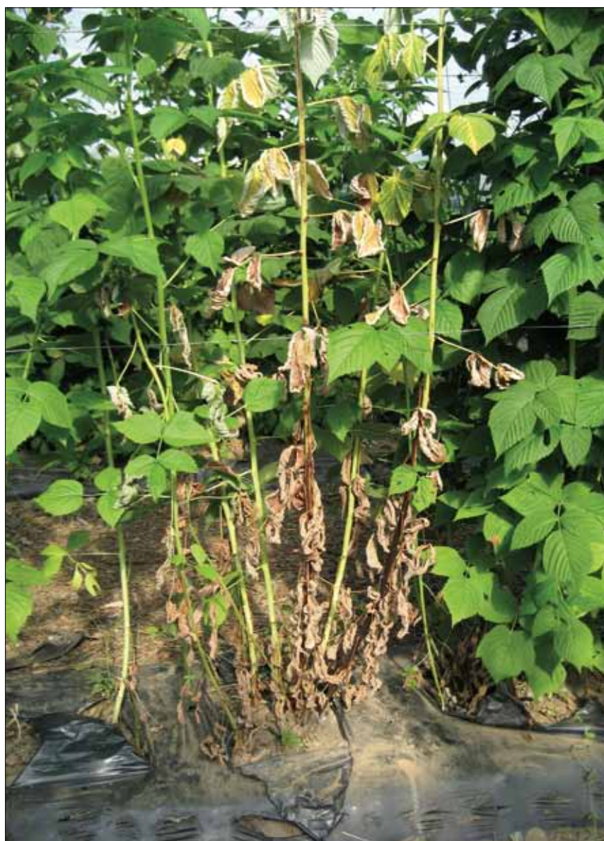
1 Symptoms of Verticillium wilt in a primocane raspberry plantation

to UK growers considering producing black or purple raspberries.