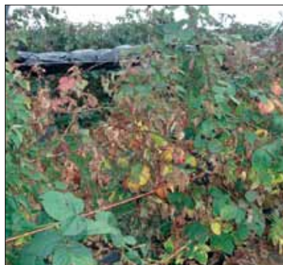
5 Browning and necrosis of leaves on blackberry