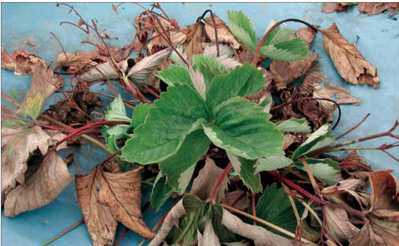
7 Strawberry is one of the most common hosts to exhibit symptoms of Verticillium wilt

As well as being introduced into a field on infected raspberry, blackberry or other hosts, Verticillium species can also spread in water and in plant debris from crops and weeds. There is very little spread of the disease from plant to plant during the growing season, although some can occur through root contact.