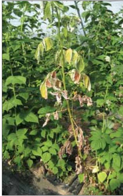
2 Classic symptoms of scorched appearance on lower foliage of a primocane raspberry

On blackberry, infected canes wilt (Figure 4) and leaves turn yellow and become brown and necrotic (Figure 5). However, cooler autumn conditions can often lead to cane recovery and disappearance of symptoms. Symptoms are usually most obvious on floricanes. Those infected canes that do survive the winter often break bud, develop and set fruit, but as warmer conditions set in, the canes usually collapse. Unlike raspberry, blackberry canes do not exhibit a purple or blue streak at ground level. Infected vascular tissue in the stem base may be stained brown, sometimes on just one side of the cane corresponding with the cane side showing leaf symptoms (Figure 6).