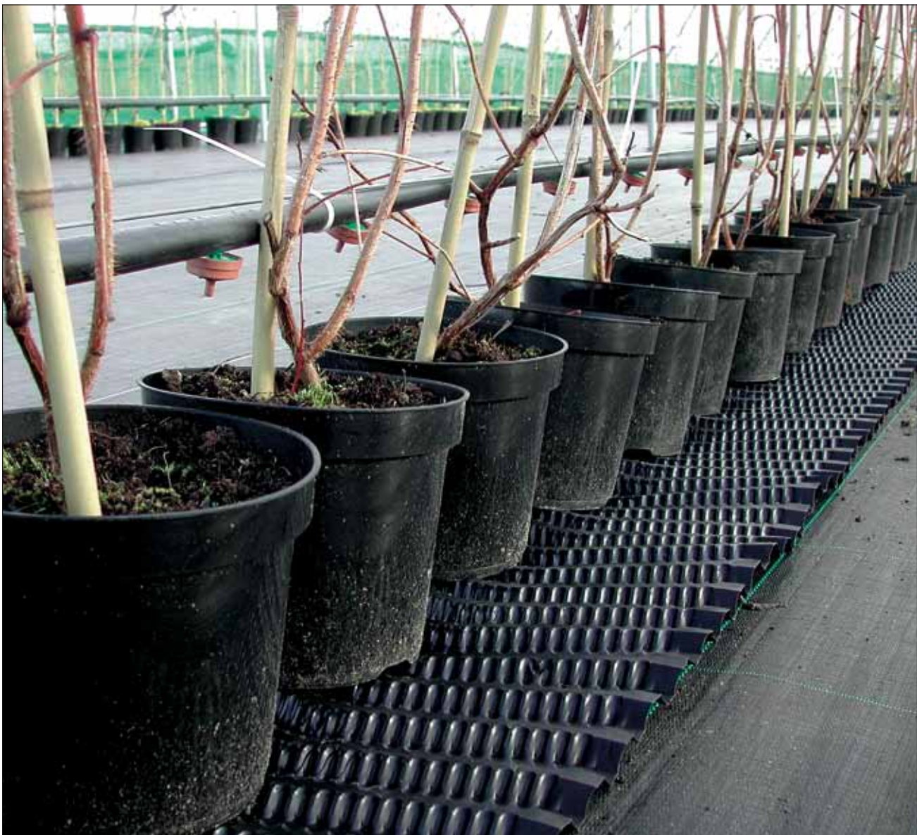
10 Where soils are too heavily infested, it may be necessary to grow in soilless substrates to avoid disease

already infected or through cross-infection from infested soils to containers that are in contact with a field soil.