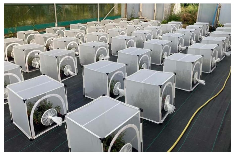
Aphid control trials run at ADAS

For further information on aphid control, watch the archived AHDB/ BPPC webinars 'Why am I having difficulty controlling aphids on my crop?' and 'SCEPTREplus: Improving the robustness of pest and disease control in IPM programmes for ornamental crops'.