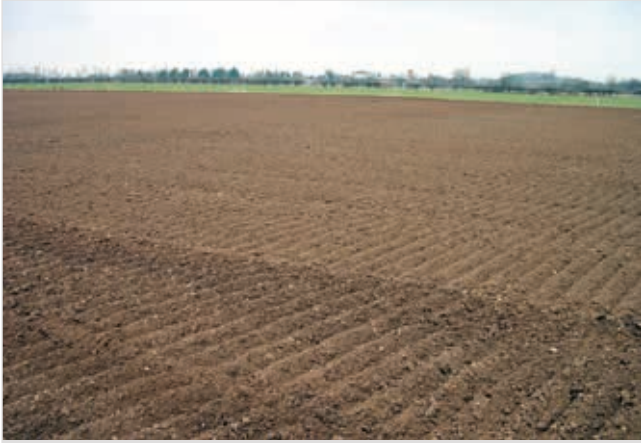
1. The SNS Index is an integral part of decision-making for fertiliser applications to all crops