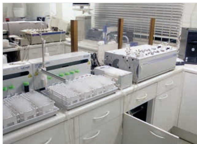
4. Make sure soils are analysed within three days of sampling

All the samples from the same batch should go to one laboratory, as small differences in handling and analysis may have an effect on the result. (Ring testing is being carried out between laboratories to ensure consistency.)