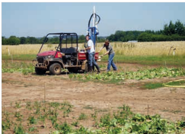
3. A mechanised soil sampler

At least 15 cores will be needed to represent a uniformly managed block of up to 20ha. Five to 10 further sampling points may be necessary where SNS levels are expected to be very high or variable after uneven amounts of leafy residues have been incorporated. It is very important that areas of the field with widely differing texture or cropping history are sampled separately.