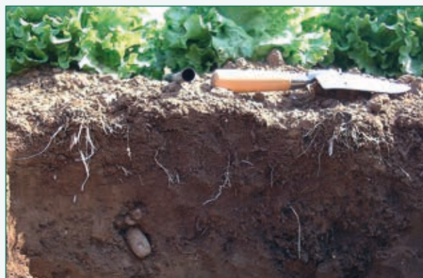
6. Shallow rooted crops have limited access to N

If the mineral N content to 45cm depth for a crisp lettuce crop is 100kg/ha N. The scaled up value to 90cm would be 200kg/ha equivalent to SNS index 5. This can be used to determine the crop N requirement of the lettuce from tables in the Fertiliser Manual (RB209) or by calculation - see below.