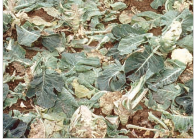
2. Brassica crop residues can contain considerable amounts of N