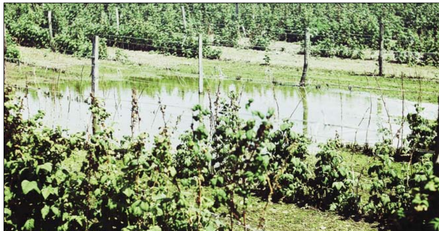
7 Waterlogging and poor drainage can lead to root death and Phytophthora infection

Early infections are often (but not always) located in areas of a plantation where the drainage is impeded. They can also be found in areas where the soil has a clay texture or in low lying areas of the field to which soil water drains. Extended periods of wet weather can spread the infection along the length of a row or to other low lying areas of the plantation.