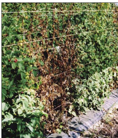
2 Symptoms first appear on single plants or isolated groups of canes