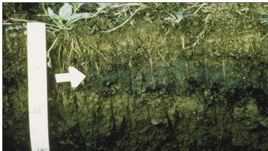
9 Examination of the soil profile can sometimes reveal signs of compaction and poor drainage