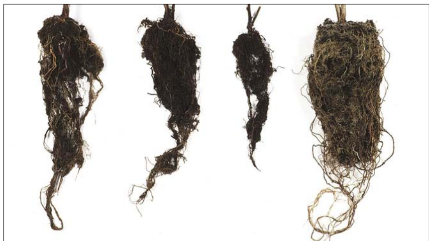
5 Illustration of poorly developed and dying root systems (three roots on left) compared to healthy roots (on far right)