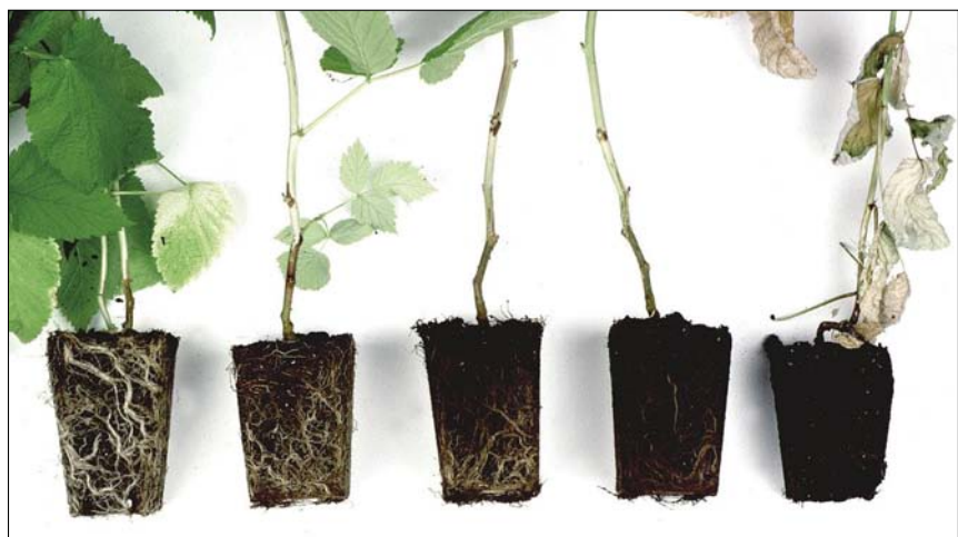
6 Declining root volume in module raised plants caused by increasing levels of Phytophthora infection