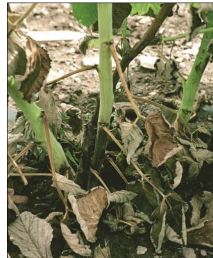
4 Water soaked lesions develop at the base of spawn, which may later turn dark purple or brown in colour