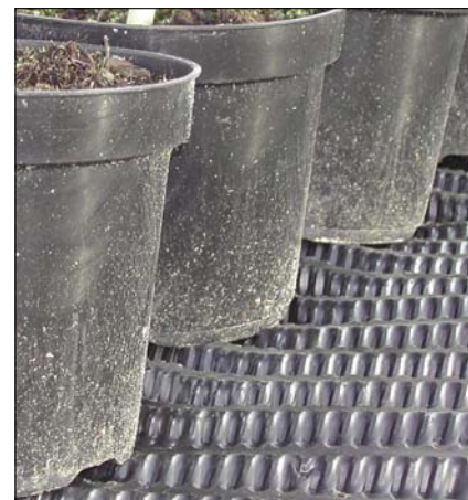
12 Use of commercial products such as Draineasi helps to improve removal of drainage water