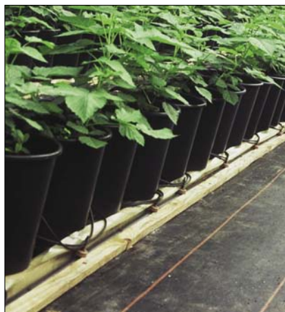
11 Use of batons beneath containers helps to improve removal of drainage water