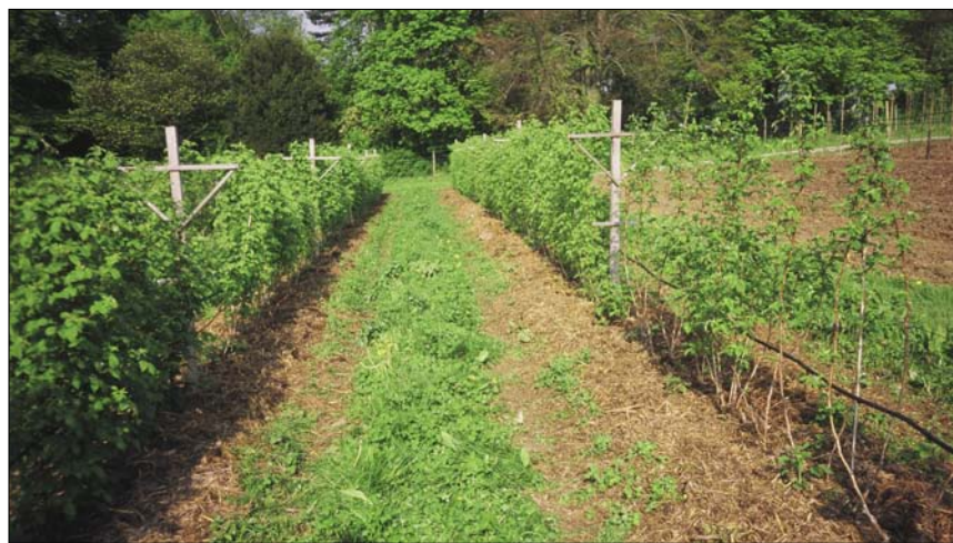
8 Composted green waste can be used as a mulch on the soil surface to improve the organic matter content of the soil and to promote the growth of new fibrous roots close to the surface

Where containerised plants are protected throughout the year, it should be possible to maintain more control over the moisture content of the substrate. However in this situation, the nutrient status of the substrate and volume of nutrients being applied should be carefully monitored. The build up of high salt levels and subsequent high EC should be avoided to obviate the need to flush out the substrate with high volumes of water. This practice can create ideal conditions for Phytophthora. In autumn and winter, when the crop is outside the main growing period, low levels of moisture can be maintained and this will reduce the spread of Phytophthora. This is in contrast to field soil grown crops, where there is very little opportunity to control soil moisture levels at this time of year, so crops are at higher risk of infection because of the likelihood of waterlogging.