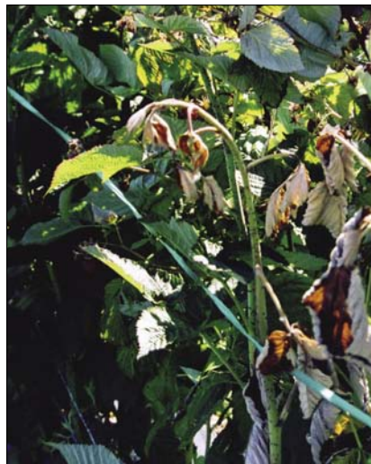
3 Affected spawn exhibiting the classic 'shepherd's crook' effect

red/brown in colour, with a distinct margin at the interface between diseased and healthy tissue. Dead root tissue can sometimes be found as far back as the crown region of plants.