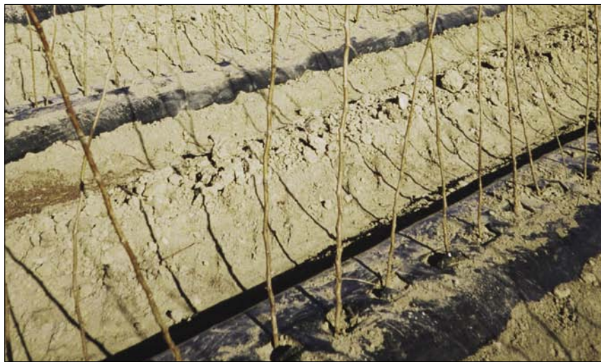
10 Planting into raised beds or ridges can help to prevent a proportion of the root system from being waterlogged

A Horticulture LINK project that is part funded by HDC (SF 63) and conducted at the Scottish Crop Research Institute has been undertaken to identify genes in resistant raspberry varieties that confer a resistance trait to Phytophthora root rot. Having identified these genes, it should be possible in future raspberry