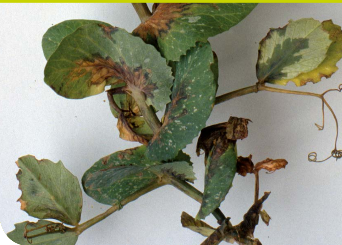
Pea bacterial blight Pseudomonas syringae pv. pisii