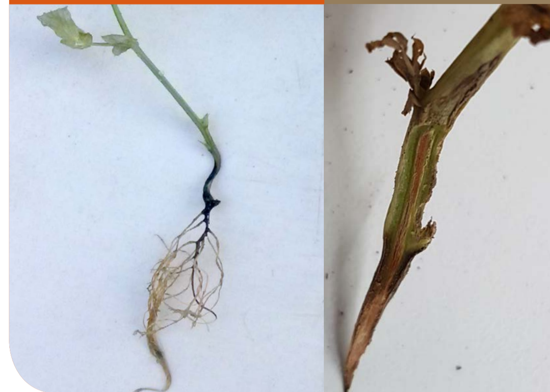
Foot rot A. euteiches