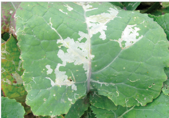
7. The characteristic white 'corridor-blotch' mines caused by leaf miner

Crop damage is caused by adult females, which puncture the leaf surface to lay eggs, and by the larvae, which produce the characteristic white 'corridor-blotch' mines when feeding between the upper and lower surfaces of the leaf (Figure 7). In smaller leaves the mine lies in the centre of the leaf and often touches the petiole, while in larger leaves the mine is to one side of the mid-rib. Green clumps of waste material are usually deposited near the margin of the mine. Several other species of leaf miner are known to attack cruciferous crops grown in Britain.