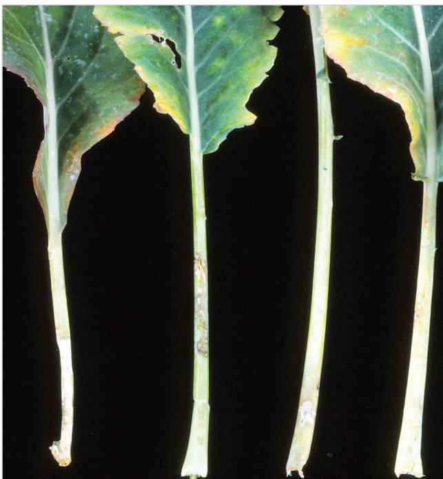
1. Cabbage stem weevil damage on Brassica petioles

Larval tunnelling within the petioles and later within the stems causes loss of plant vigour. Damage to the stems also facilitates infection by fungal diseases (Figure 2).