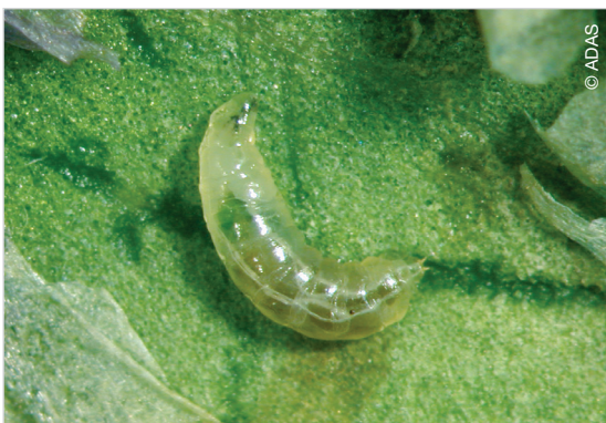
9. Leaf miner larva