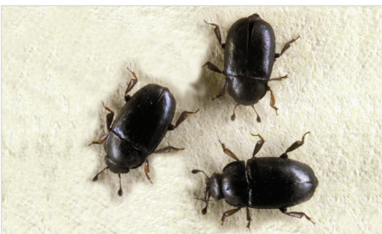
11. A close up view of adult pollen beetles