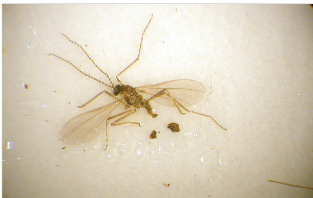
6. Swede midge adults are difficult to distinguish from other closely related species