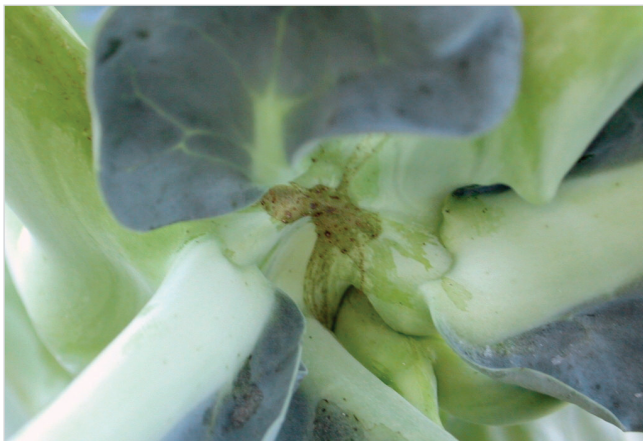
5. Swede midge causes damage by scarring at the growing point

The swede midge attacks many Brassicas and leads to swollen flowers, scarring in the growing point, on leaf petioles and flower stalks. It also causes blindness and crinkled leaves (Figure 5). It often kills the main shoot so that the side shoots grow out causing a many-necked plant.