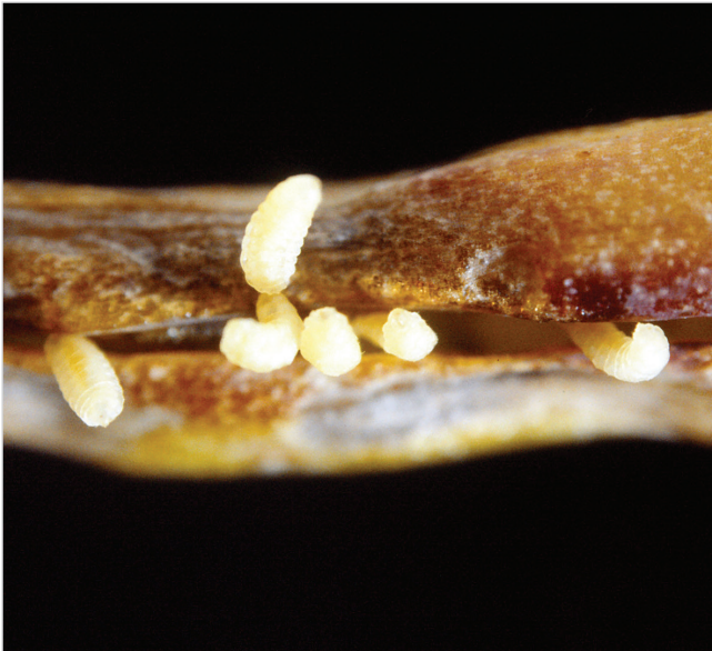
3. Cabbage stem weevil larvae emerging from a Brassica stem