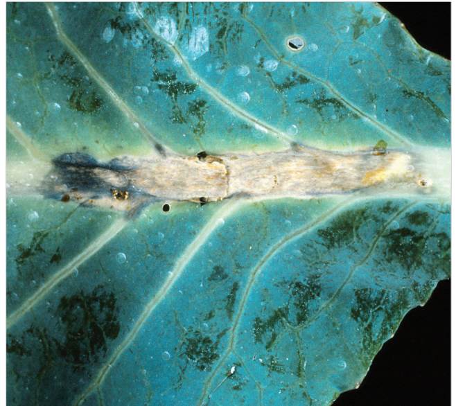
4. Stem weevil adults lay eggs in May by boring holes in the petioles of the Brassica leaf