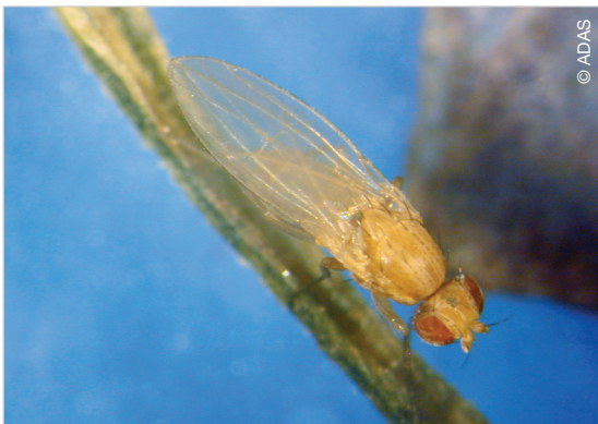
8. Adult leaf miners are distinguishable by their pale appearance, faint stripes on their thorax and red eyes