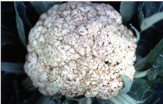
10. Pollen beetles damage caused by feeding on cauliflower curds

Adult beetles graze on cauliflower curds and broccoli heads (Figure 10). This usually occurs in mid-summer when the new generation of adults emerges (see life cycle). This type of damage occurs very sporadically. Proximity to crops of oilseed rape increases the risk.