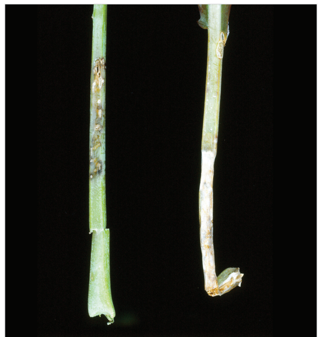
2. Larvae tunnel into the petioles and stems causing loss of plant vigour and increase the chance of fungal disease infection