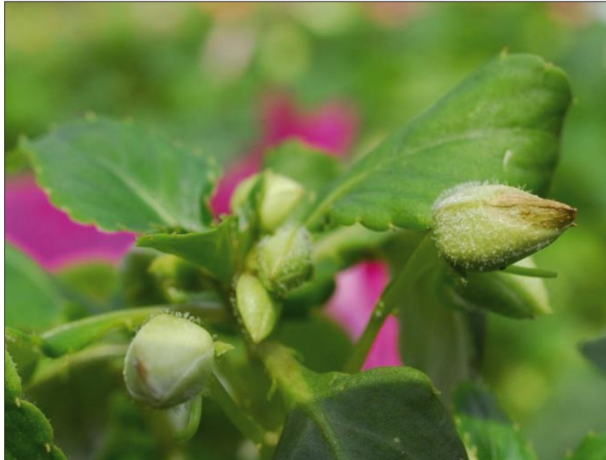
5 Diffuse sporulation on impatiens flower bud

In India, over-wintering spores of P. obducens , as well as vegetative strands of the pathogen, have been detected inside seed harvested from diseased I. balsamina plants. When sown, such infected seed was reported to have given rise to systemically infected plants. The HDC funded project PC 230, has shown that many seed-lots were contaminated with the DNA of P. obducens , yet when such seed-lots were grown on under conditions conducive to downy mildew development, no disease symptoms were expressed. The significance of the pathogen DNA in or on seed-lots therefore remains unclear at the current time though perhaps suggests the detected pathogen is non-viable.