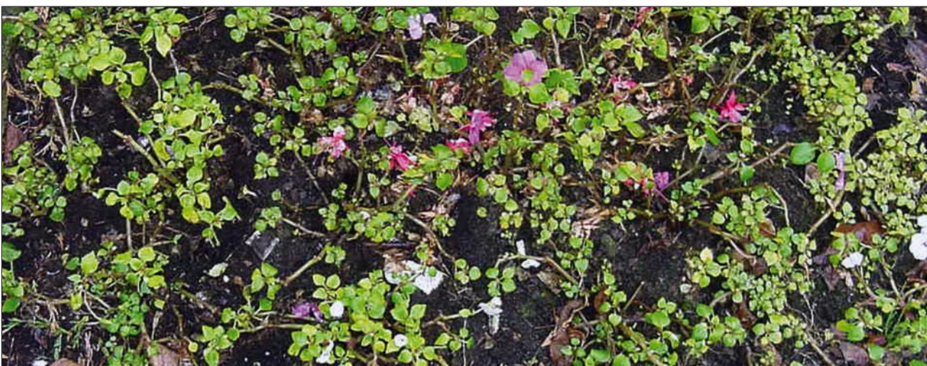
9 Impatiens plants in a floral display showing signs of severe infection