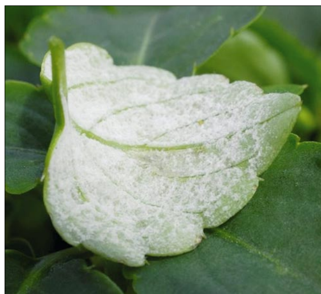
4 A dense, white layer of spores and spore-bearing structures of Plasmopara obducens on the lower surface of an impatiens leaf