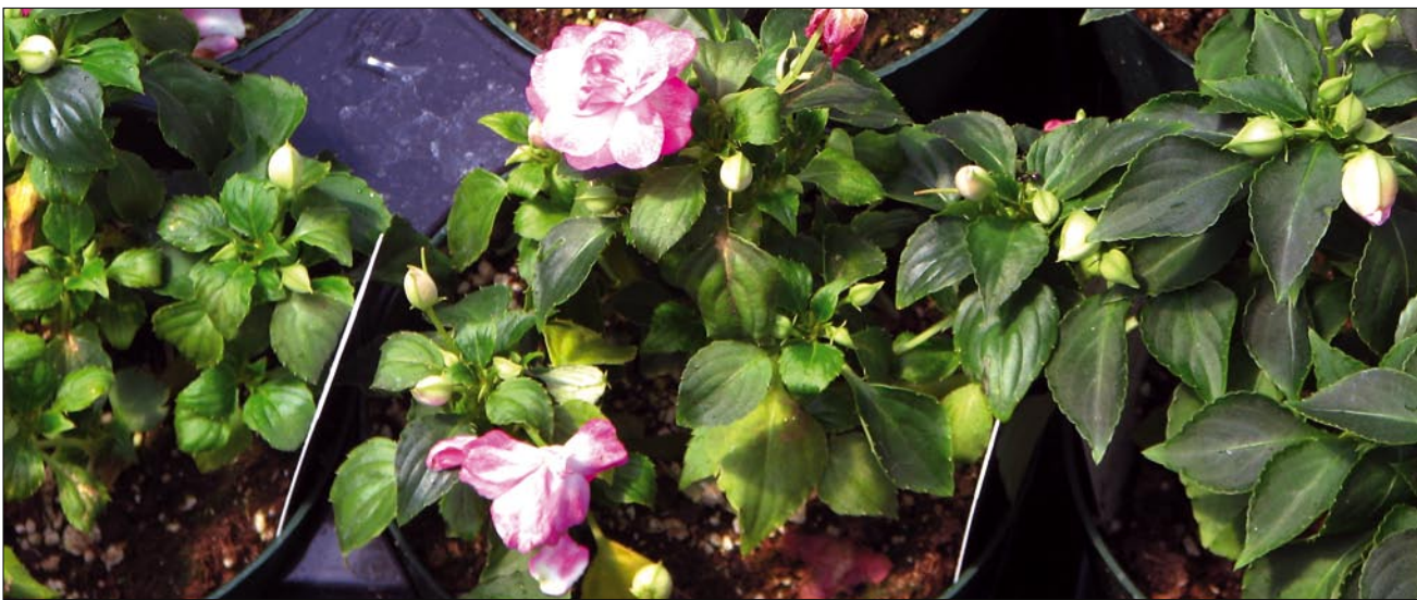
8 Early symptoms of leaf yellowing and stunting on a crop of impatiens

Impatiens crops have not previously required much in the way of fungicide applications but, given the recent increased prevalence and severity of the disease consideration should now be given to a routine preventative programme for downy mildew control. Regular early treatments with fungicides are advisable from the outset to minimise any risk from potential seed-borne infection and introduction via vegetative cuttings. The use of systemic products with good activity should be used where possible. Non-systemic protectant fungicides are also important in a programme of sprays to reduce the risk of resistance developing. Fungicides that have been used successfully to control downy mildew diseases of various crops and are permitted on protected and outdoor ornamentals (at growers own risk) are shown in Table 1.