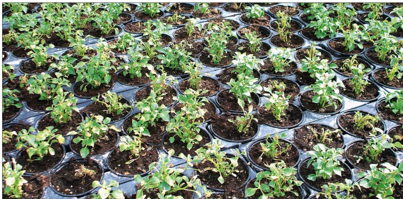
7 Extensive disease symptoms (including plant death) in a crop of pot grown impatiens

humidity levels and surface moisture which encourages disease development (Figure 7). A single diseased plant can potentially generate sufficient spores to infect hundreds of others in the confined space of a glasshouse.