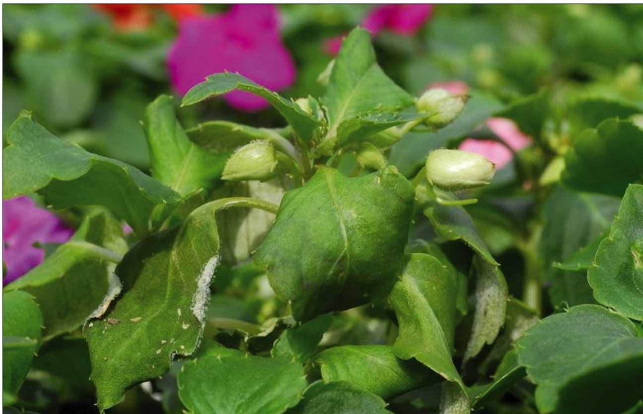
2 Early disease symptoms on impatiens – leaf paleness and curling

for the main veins (Figure 4). Usually as symptoms develop leaves fall prematurely from the plant leaving a series of unattractive bare stems, in some circumstances however leaf fall can occur with minimal levels of associated sporulation making disease identification difficult. Plants infected early are likely to be stunted and produce small, pale green or yellow leaves. Flowering is usually reduced or absent as a consequence of infection.