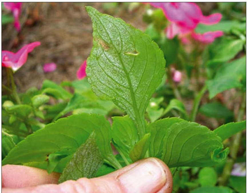
1 Sporulation on the lower leaf surface of impatiens identifies the problem as P. obducens