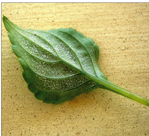
3 Diffuse, white, spores and spore-bearing structures of Plasmopara obducens on the lower surface of an impatiens leaf