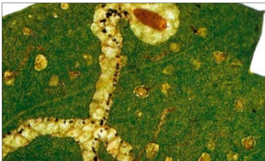
9 Mines of the native chrysanthemum leaf miner, showing the blobs of frass (droppings) and pupa at end of mine