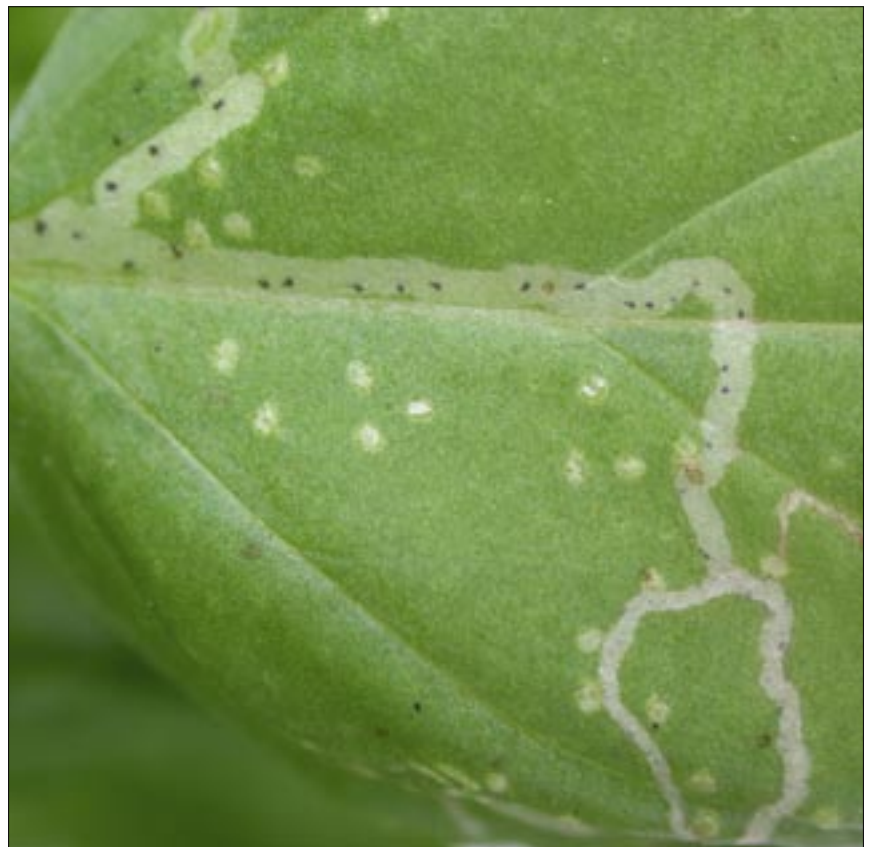
1 Adult feeding punctures (white spots) on the upper leaf surfaces are the first sign of damage