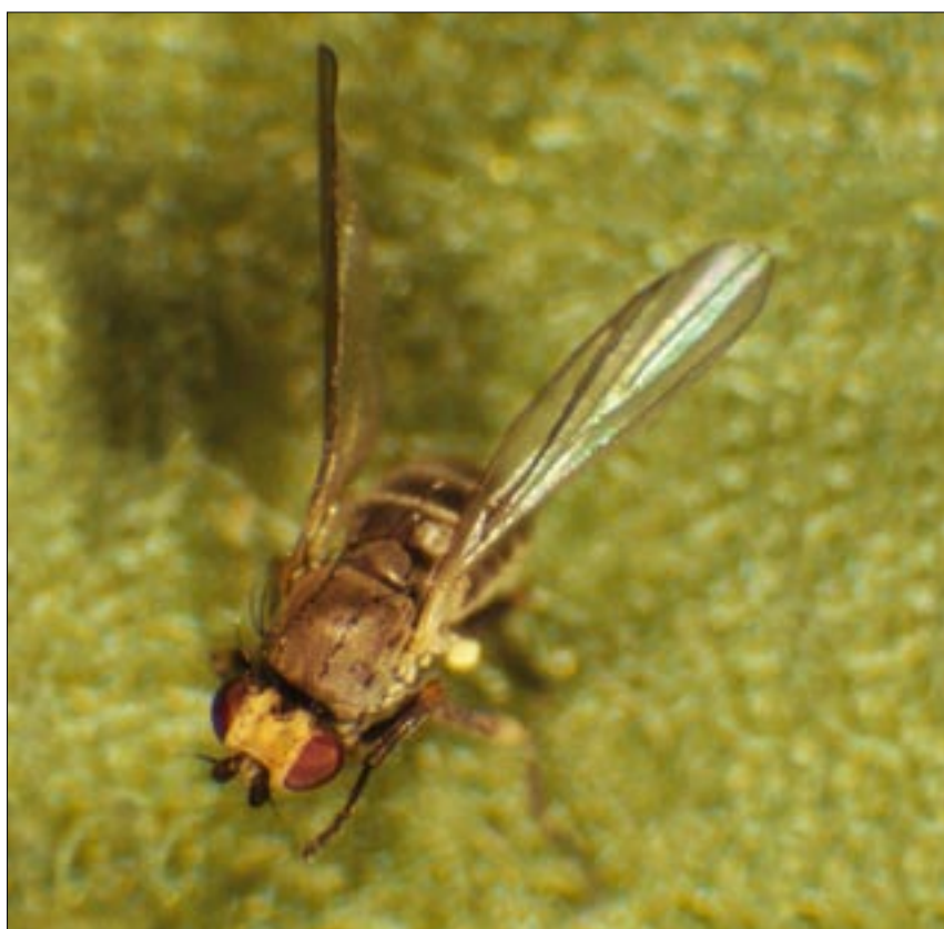
2 The adult native chrysanthemum leaf miner has a grey-black body with no yellow spot on its back

Four native Liriomyza species could occur on bedding and pot plants hosts. However, any leaf miners or damage symptoms on protected ornamentals that match the description of Liriomyza species should be reported to PHSI who will check whether it is a quarantine species. This is particularly important if plants have been imported. Plant passporting is required for all herbaceous plants within the EU (when not packaged for final point of sale) as part of the controls for quarantine Liriomyza species.