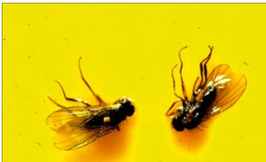
8 Quarantine South American leaf miner adults on sticky traps can be recognised by the yellow spot on their backs