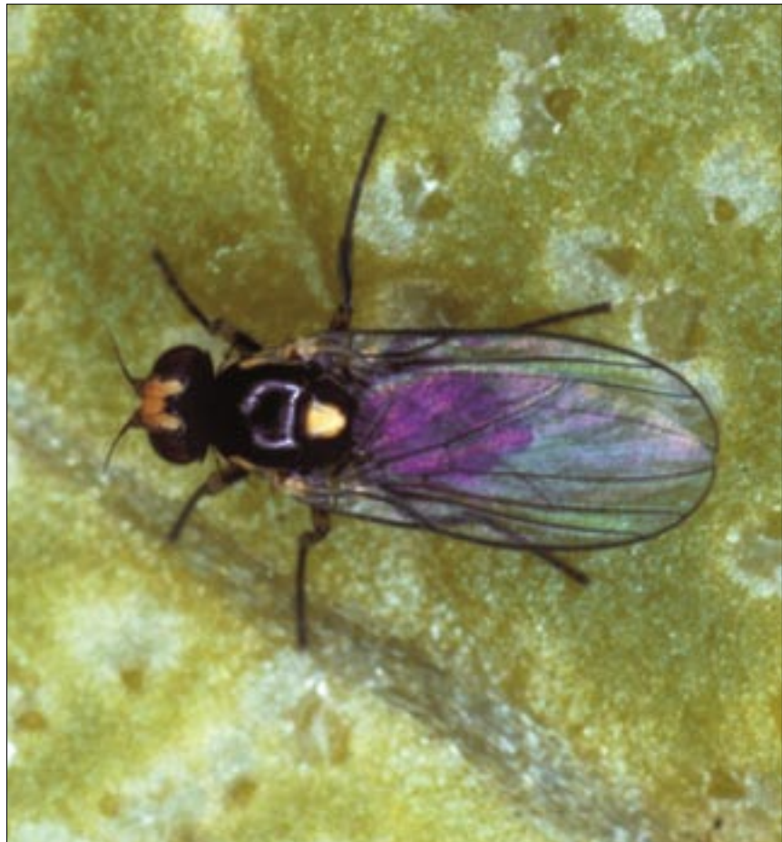
3 The adult quarantine South American leaf miner has a bright yellow spot on its back, like other Liriomyza species

These species have a very wide host range, including both edible and ornamental plants. They may be introduced with imported cuttings (eg chrysanthemums), young plants and produce. However, L. sativae is more likely to occur on vegetable crops. UK outbreaks of L. trifolii or L. huidobrensis have occurred on a range of bedding and pot plants, including aster, chrysanthemum, Lantana , primula, verbena and viola. Weed hosts include bittersweet ( Solanum dulcamara ), chickweed ( Stellaria media ), common ragwort ( Senecio jacobaea ) and groundsel ( Senecio vulgaris ).