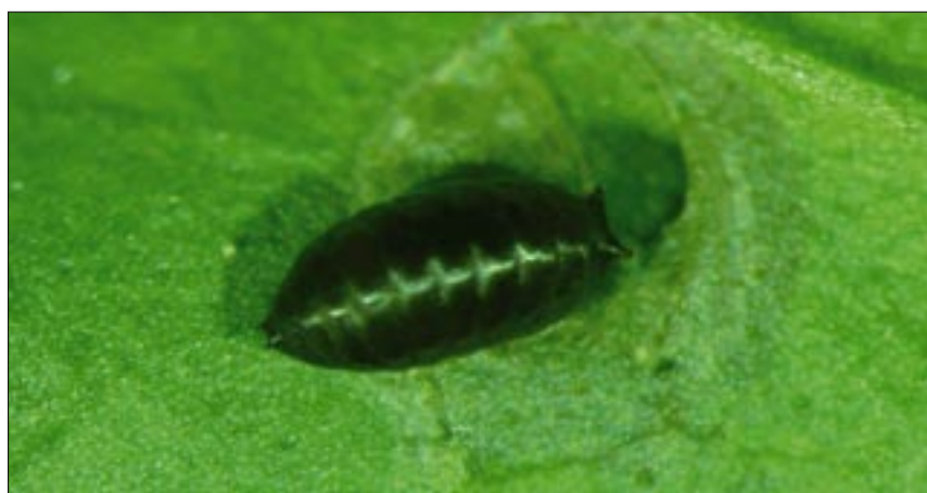
7 Liriomyza spp. may hang from the leaf or lodge on a lower leaf before dropping to the ground to pupate