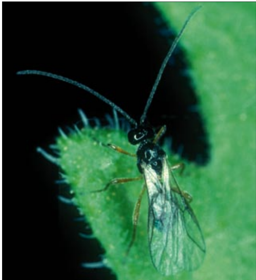
11 Dacnusa sibirica , a small black parasitic wasp with long antennae, lays its eggs inside leaf miner larvae

Diglyphus can be used at any time of year at temperatures as low as 10°C, but establishes better at higher leaf miner densities as the adults need to 'host-feed' on the young leaf miner larvae in order to produce eggs. Thus