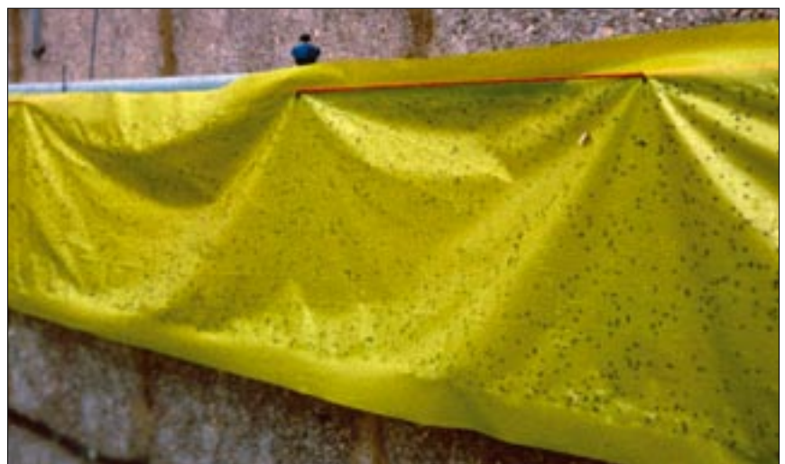
10 Long curtain traps can be useful for mass trapping in heavy infestations between infested crops and new batches of plants, or in empty glasshouses