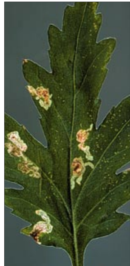
5 Mines of American serpentine leaf miner are usually tightly coiled and almost blotch-like