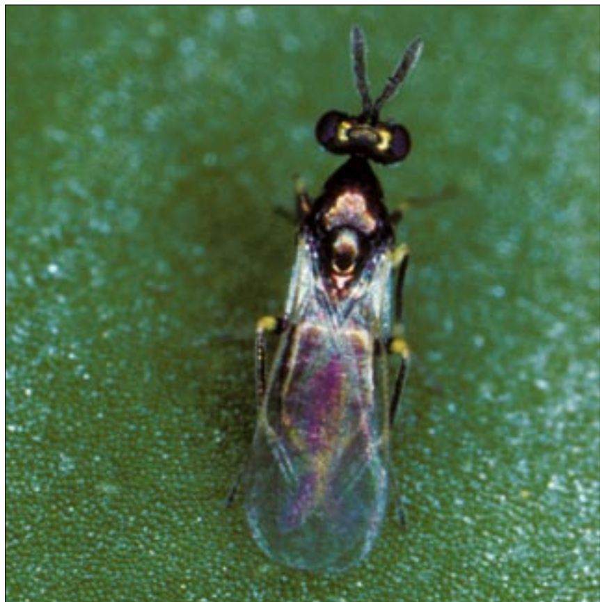
12 Diglyphus isaea , a small metallic green parasitic wasp with short antennae, lays its eggs onto leaf miner larvae