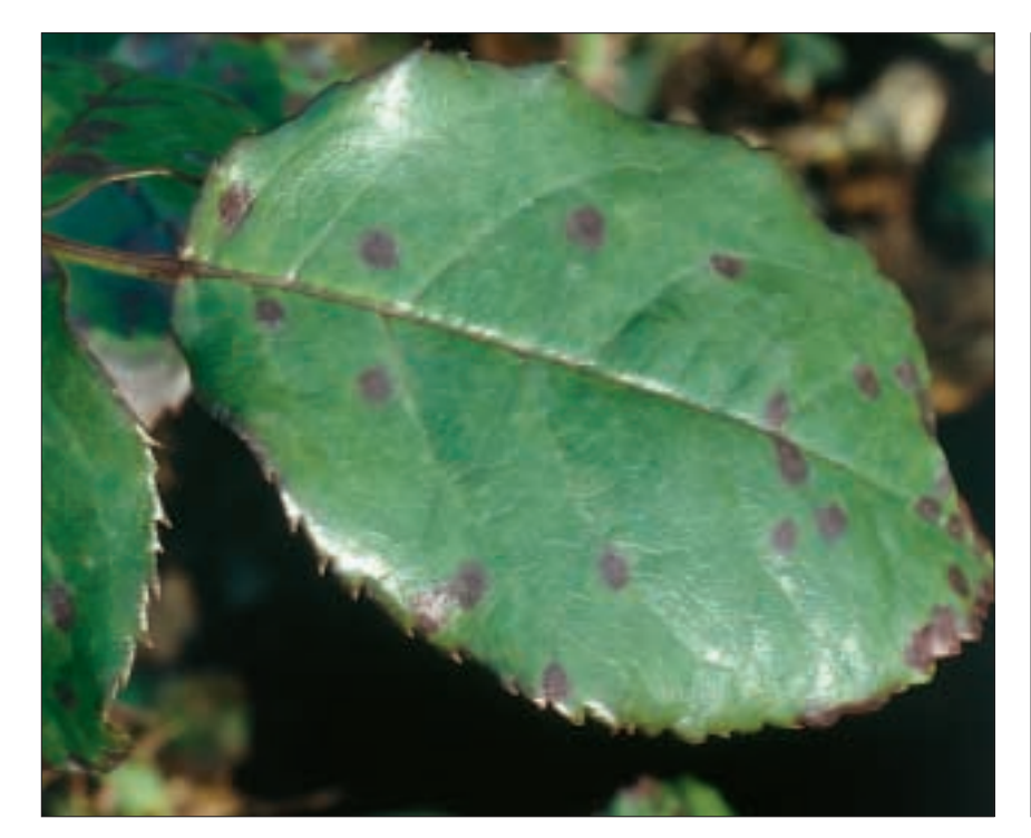
8a Rose downy mildew ( Peronospora sparsa ) results in purplish spots on the upperside of leaves that may be mistaken for black spot ( Diplocarpon rosae )

Given the dependence of P. sparsa on moisture, it explains why downy mildew is most commonly found where roses are grown at a high density, with frequent overhead irrigation and in glasshouse crops over winter. The period between infection and appearance of symptoms is also temperature dependent, being as short as 4 days at 20-25°C and up to 7 days at temperatures in the 10-20°C range.