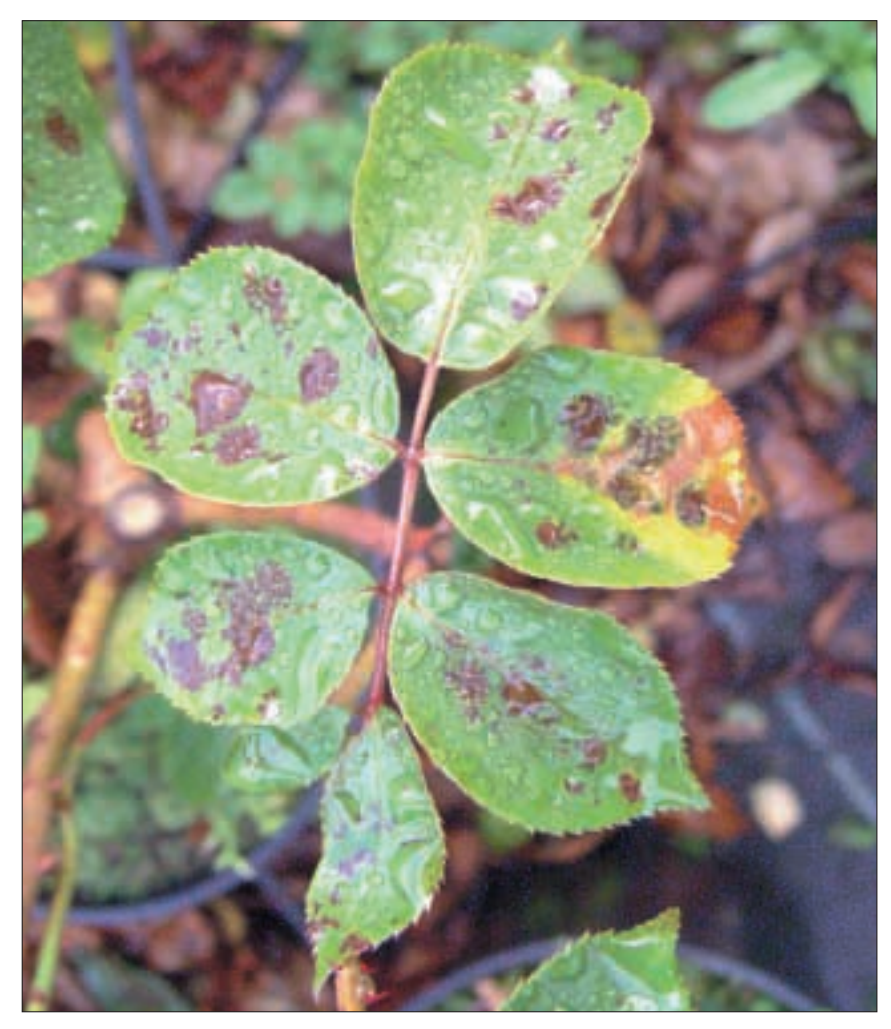
1 Black spot - purplish black spots up to 1.5 cm in diameter develop on the upper surface of leaves