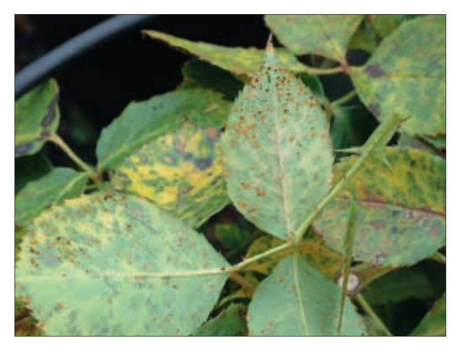
5 Rose rust - bright orange and, later, black spore masses develop on the lower leaf surface