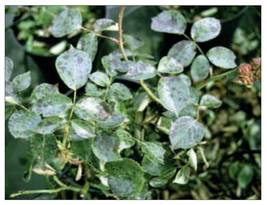
6 Widespread black spot on cv. 'Silver Wedding'

The fungus survives between seasons as dormant fungal strands within the wood of rooted plants and within the tissues of cuttings. The fungus also produces resilient resting spores in affected plant tissues but their