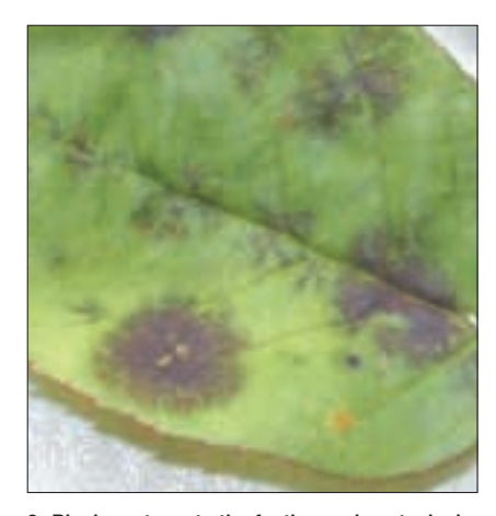
2 Black spot – note the feathery edges typical of this disease

Although an attack of rust on the susceptible rootstock Rosa laxa does not appear to affect bud take, it can seriously affect the quality of maiden bushes.