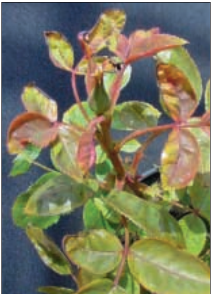
11 Damage on cv. 'Courage' from a tank mix of Nimrod T + Twist (double rate) 1 week after spraying in spring (sourced from HNS 106a)