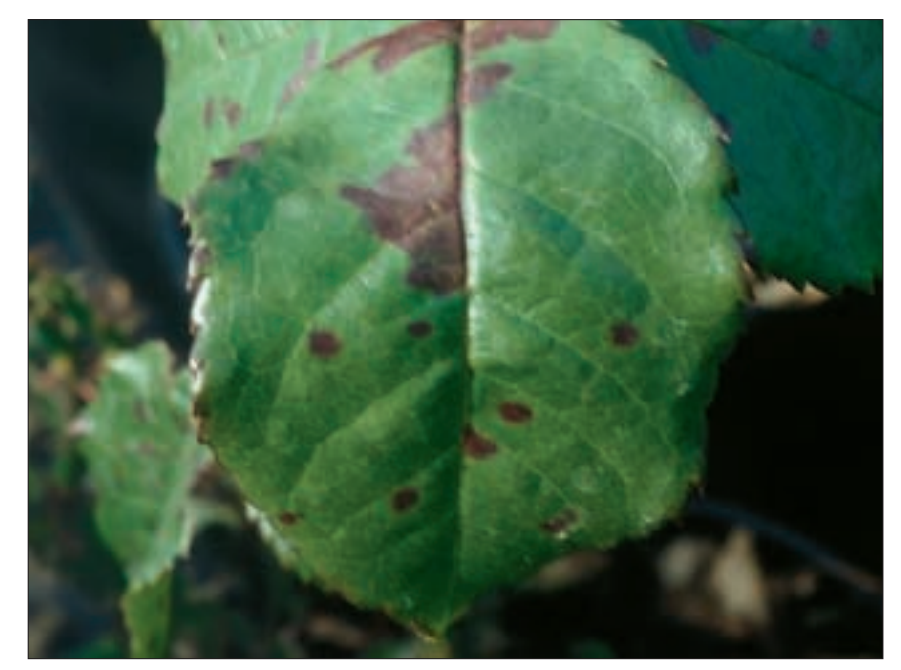
4 Purplish leaf spots and angular blotches are a common symptom of downy mildew