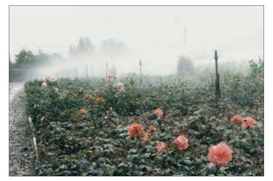
10 Avoid watering from overhead late in the day or during the evening