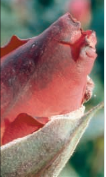
8b Downy mildew may cause purplish marking on the stem, calyx and petals (above), as well as spotting on leaves