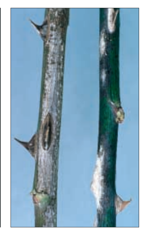
7a and 7b Powdery mildew can also affect flowers and stems