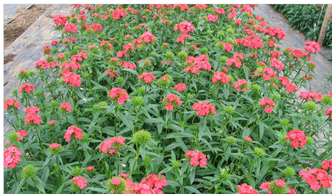
3. A standard planting density of 36 plants /m 2 appears to be optimal

There appears to be little opportunity to manipulate the crop quality of annual dianthus through varying the planting density.