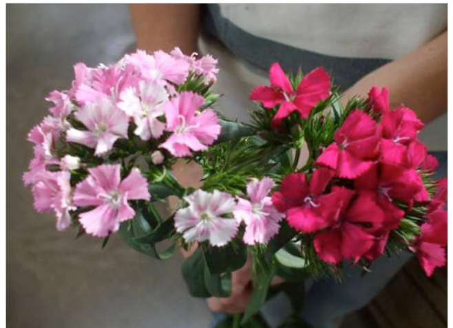
2. Correct picking stage for dianthus

Plants are usually harvested when three to five florets have opened, stem length should be at least 60cm. The cut stems have the potential to be used in either bouquets or 'straight' lines.