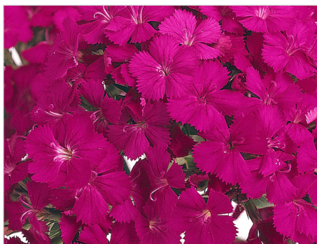
'Amazon Neon Cherry'

With a range of vibrant flower colours and glossy green leaves, they thrive grown cold but are heat-tolerant, producing strong, upright stems over a long season. They are popular for use in bouquet work and have potential as 'straight' bunches.