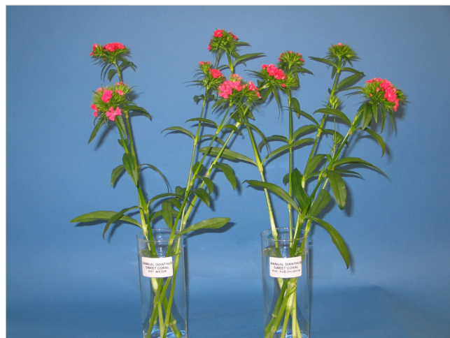
4. Annual dianthus has good vase-life qualities

Provided varieties with poorer post-harvest qualities are screened out, annual dianthus can produce good quality stems with acceptable vase-life.