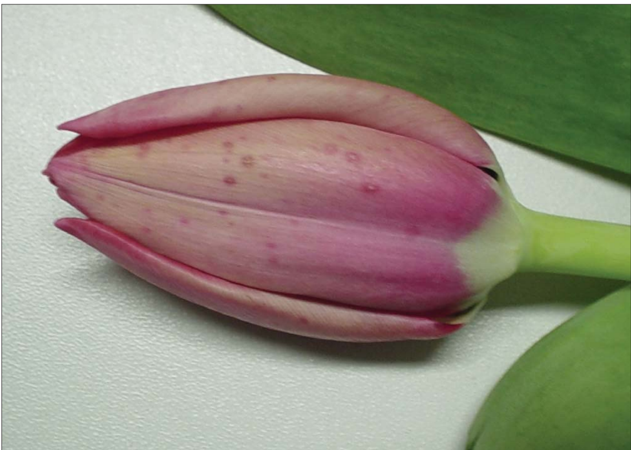
3 Botrytis infection on cut tulip petals