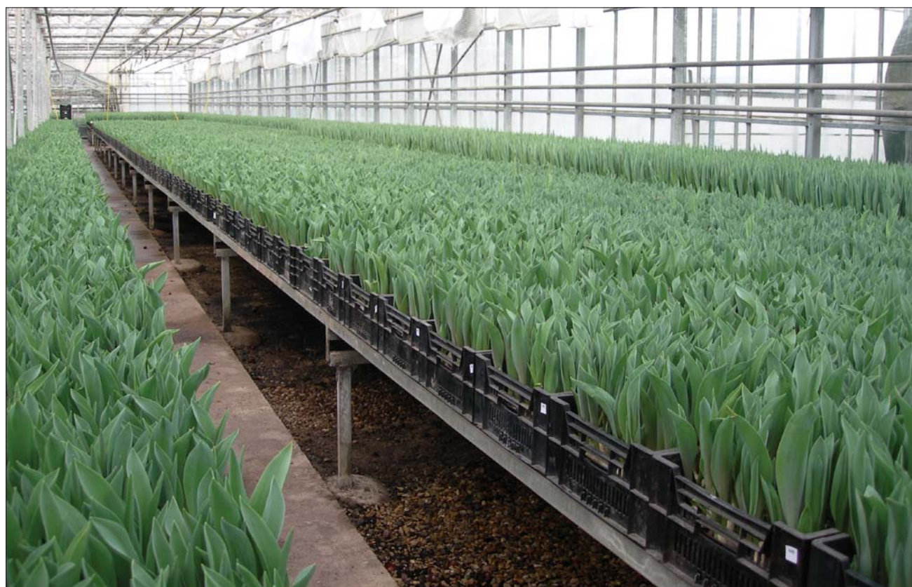
1 Tulips growing in water culture

In the process of post-harvest handling it is therefore important to