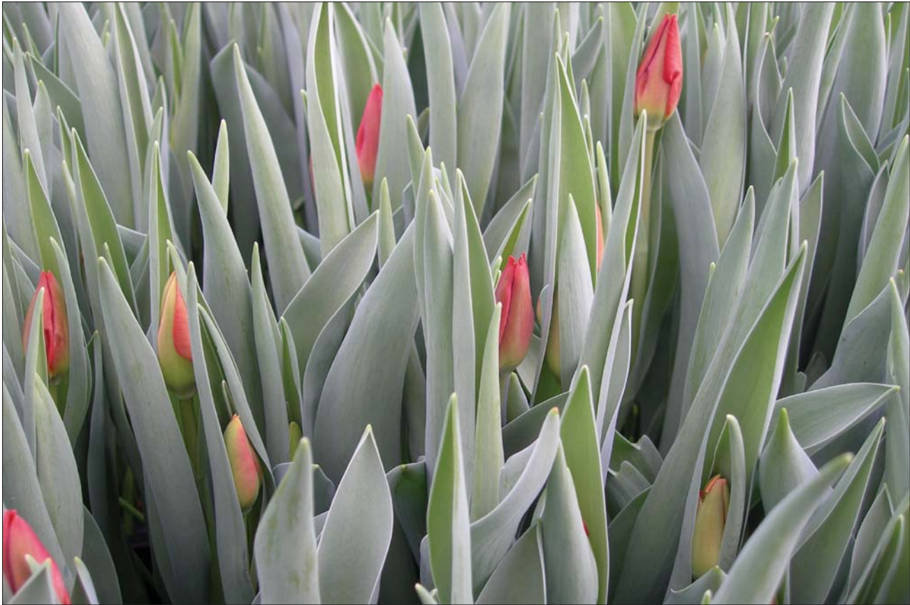
2 Tulips approaching the point of harvest

of growing (ie water, soil, peat etc) and what temperature the tulips are forced at, are taken into consideration as these factors can also affect the end vase life of the cut tulips.