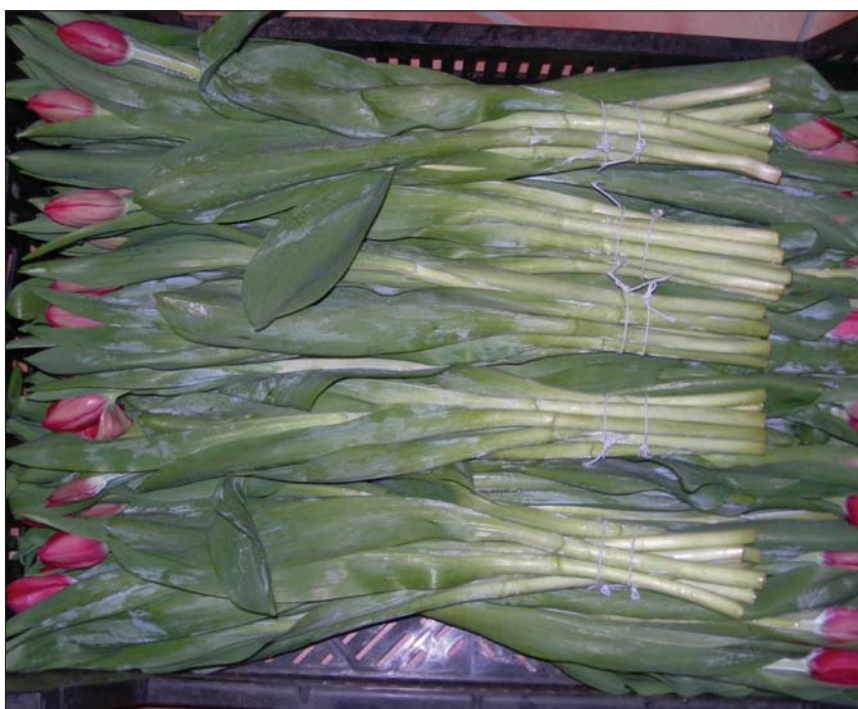
4 Cut tulips upright, wrapped in buckets (top) and tulips dry, flat in trays (bottom)