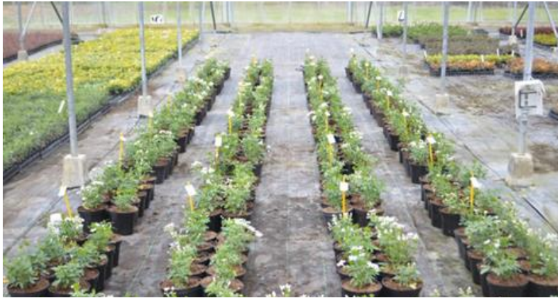
Figure 2: Choisya sp. finals at the nursery trial site directly after potting on 27 April 2016.

Two rows of four 10-pot plots per replicate, (viewed from replicate four towards replicate one).