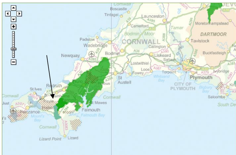
Figure 3 NVZ map of Cornwall

With a lot of Cornwall falling into an NVZ restricted zone which are shown by the shaded areas in figure 1 and Riviera's position being indicated by the arrow, the use of fertiliser has to be closely monitored. Especially as the company can travel as far north as Padstow which is an area not covered by an NVZ. For this reason Riviera produce could also benefit not only from saving money through the use of precision fertiliser but there are also vast environmental benefits due to both the climate and working conditions that Riviera have to deal with.